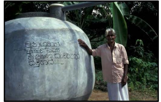
A storage tank designed to hold drinking water

Many of the projects undertaken by Practical Action involve engineering activities. For example, to increase income and access to food for women, the elderly and other vulnerable groups. Projects have included natural 'zeer pot' refrigeration systems designed to keep food cool, fish cages that allow people in Bangladesh to grow fish in local ponds and floating gardens that can assist in the growing of food on normally flooded land. Rainwater harvesting technologies, such as soil ridges and water storage tanks, result in improved access to water for both drinking and irrigation purposes.