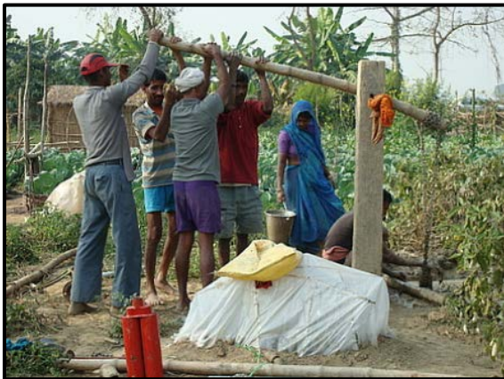
Farmers installing a new treadle pump

It is extremely difficult to grow food in parts of the world where rainfall is sparse and erratic. In such climates the land is simply too dehydrated to be of any use, resulting in people struggling to feed even their own families, let alone grow food to sell. Irrigation systems such as drip systems and treadle pumps are used to tackle this issue. Able to be operated by one or two adults, a treadle pump uses pedal power to suck water up from wells up to 7.5m deep in the ground at a rate of up to 18m 3 per hour; that is about six times more water than can be drawn from a traditional hand pump. It can be operated by just two people and is less tiring to use than a hand pump. A treadle pump also brings money into the local economy, through the use of locally manufactured parts.