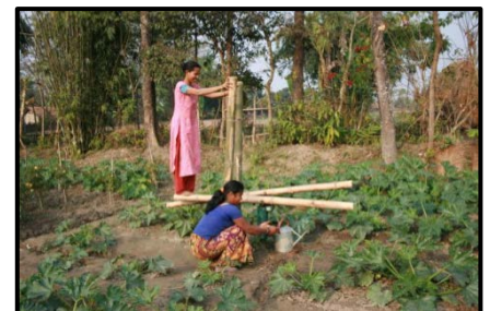
A treadle pump in use in Nepal

You have been asked to design a treadle pump for use in remote areas. You will need to carry out concept development to produce visual design solutions. You must use CAD software to create a 3D model of the treadle pump that can be shared with potential sponsors who will fund the manufacture and the engineers who will work locally to produce it.