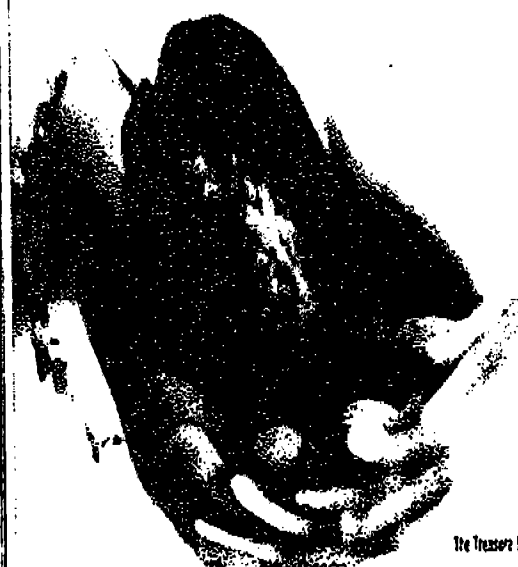
The Treasure Leaf

330 Orchard Road Singapore 238865 Tel: (65) 6735 5800 Fax: (65) 6735 9360 www.singaporemarrriott.com