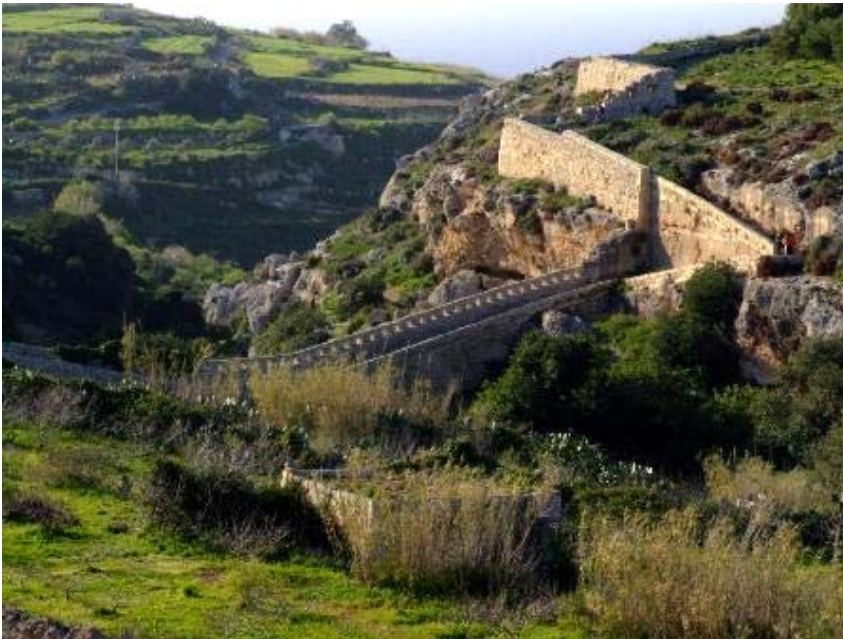
The Victoria Lines

1.1. Which country was ruling Malta when the Victoria Lines were built?