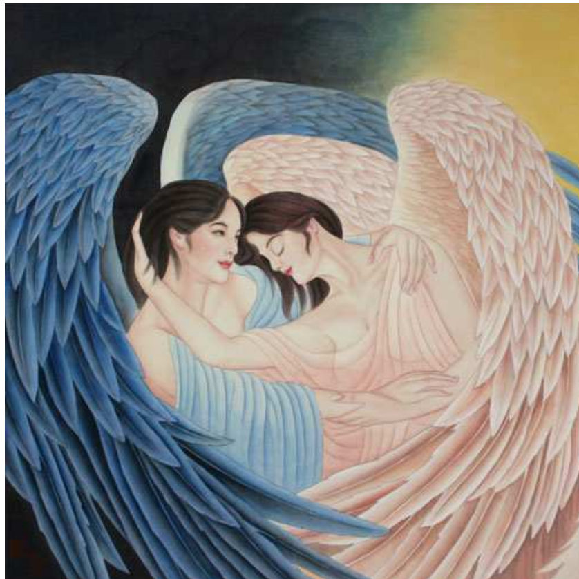
Figure 3: South Chinese Folk Art