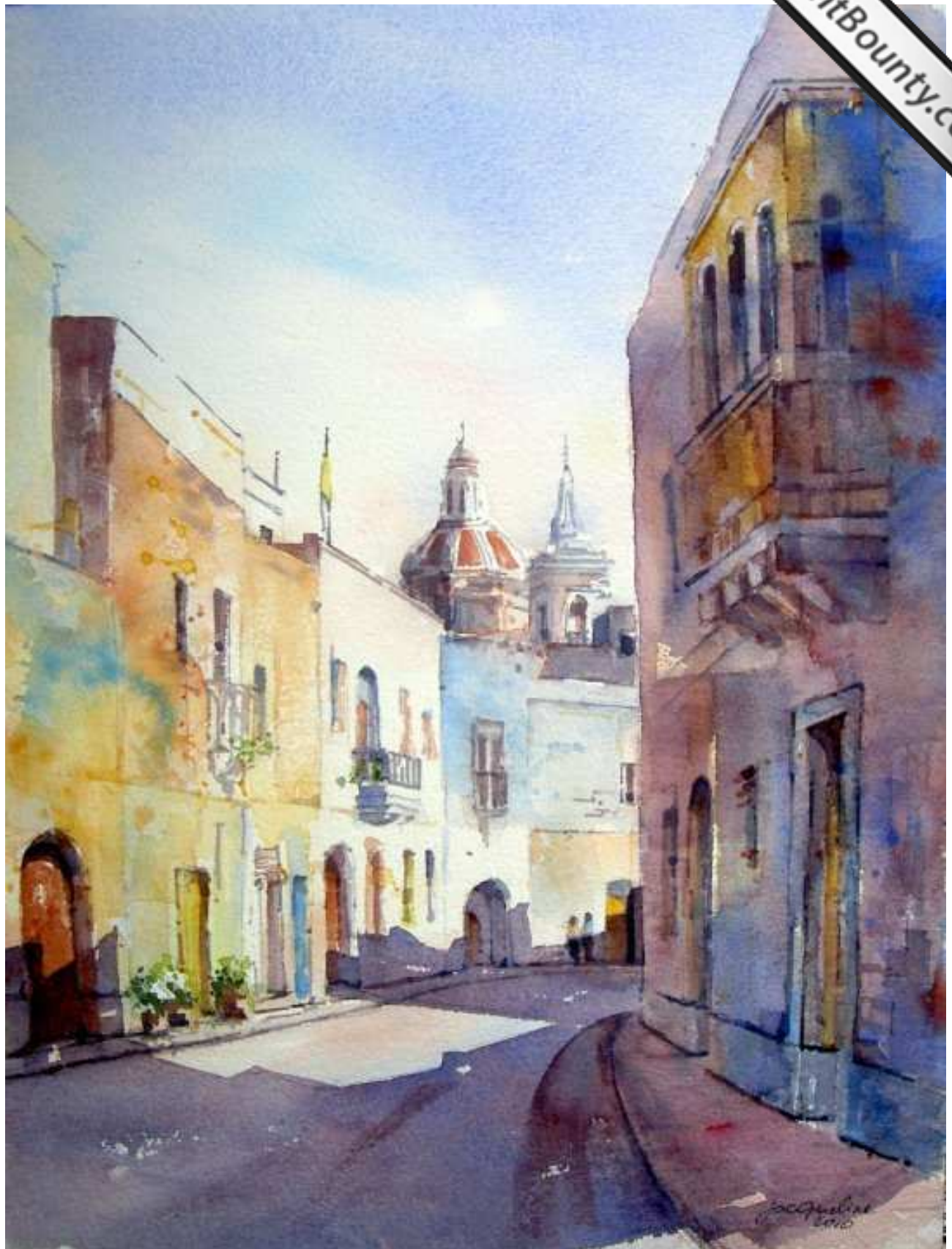
Figure 1: Jacqui Agius – Village Street