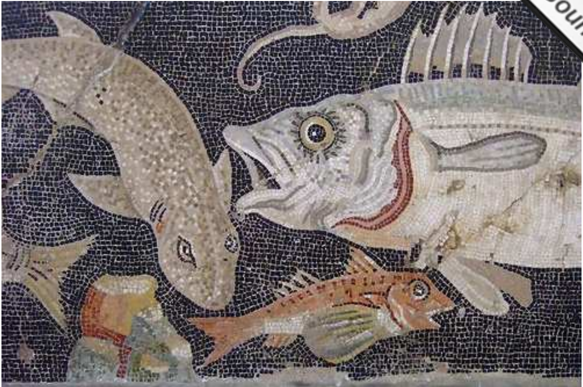
Figure 2: Pompeii Mosaic