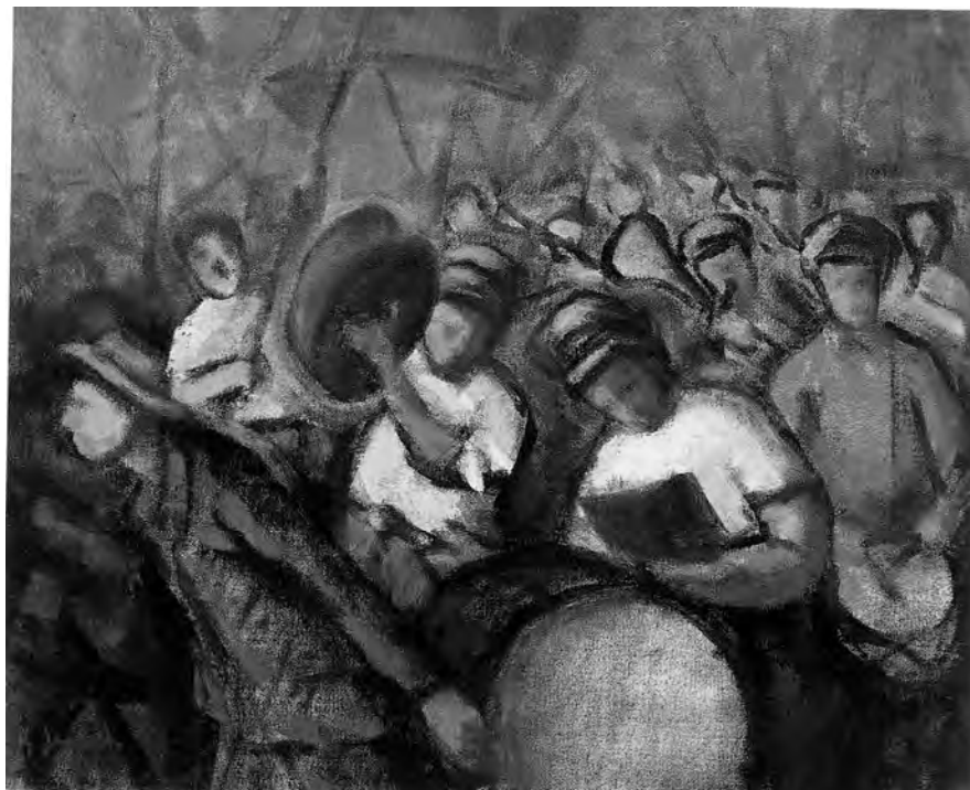
Figure 2: Il-Banda – George Fenech