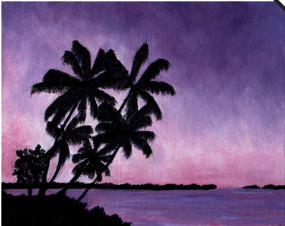
Figure 1: Palm Trees at Sunset