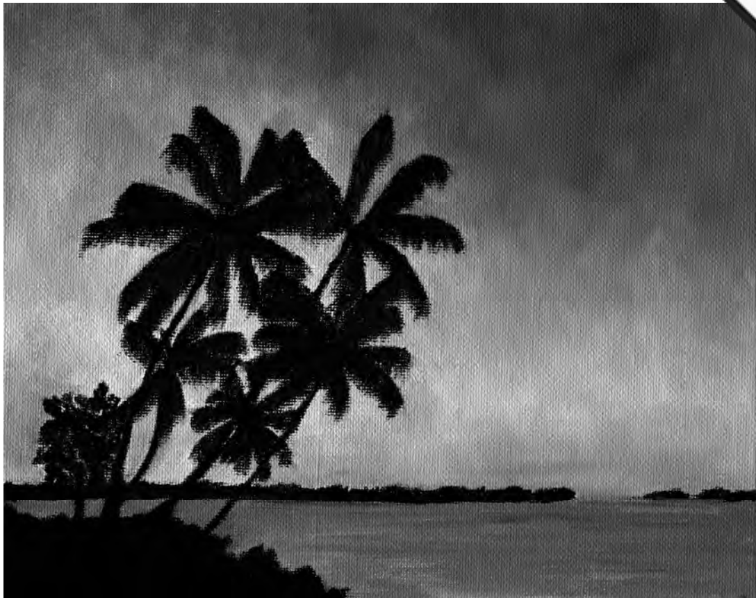
Figure 1: Palm Trees at Sunset