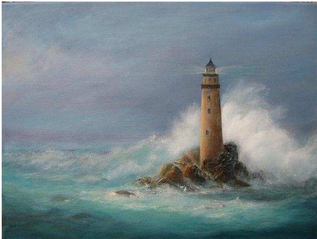
Fig. 2 – Lighthouse – Rita Palm