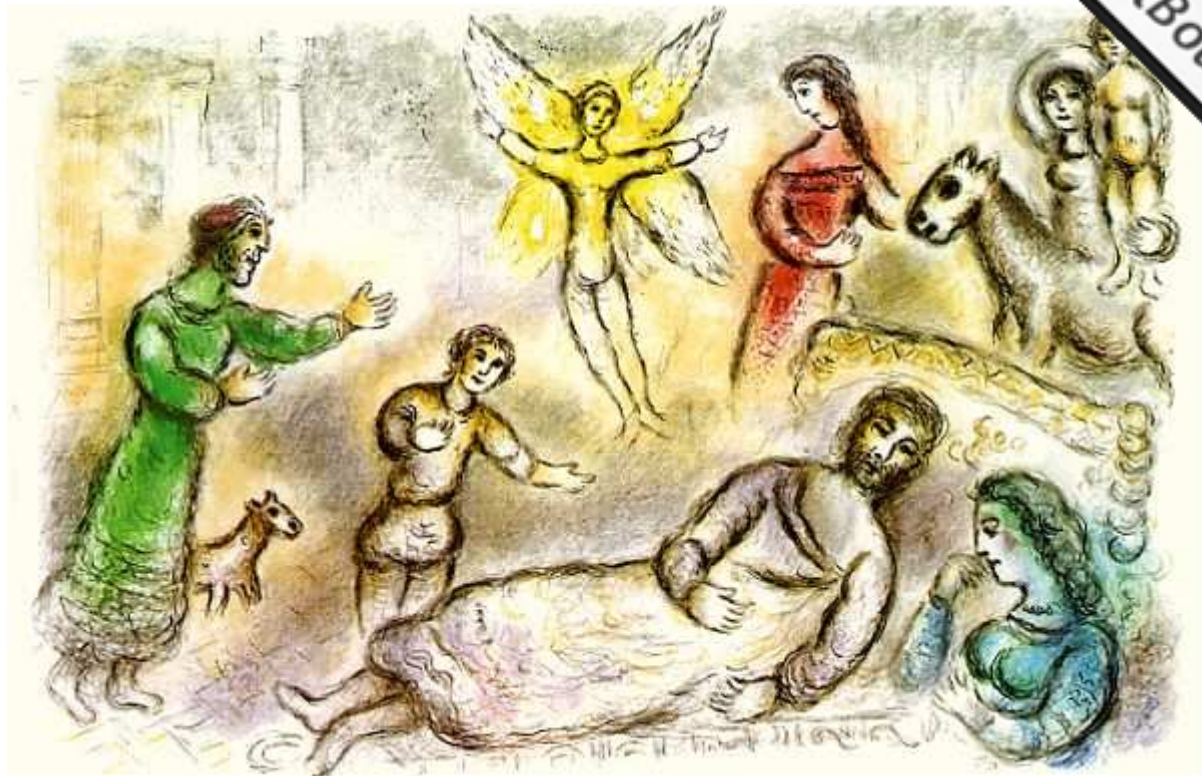
Fig. 1 – Peace Again – Marc Chagall