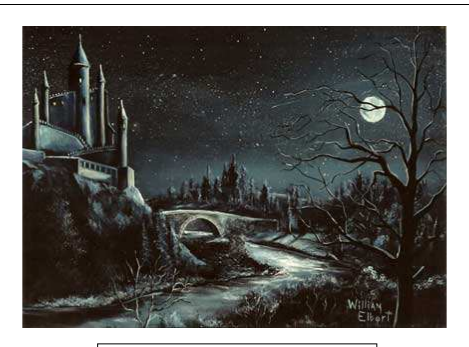
Fig. 1 – Fantasy Castle – William Elbort

Create a picture using four of the following objects: Fruit, Vegetable, Wooden Spoon, Water Jug, Cup, Box, Shell.