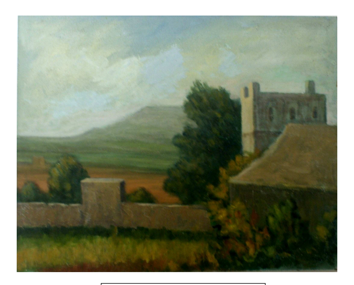
Fig. 2 – Razzett - Anthony Sciberras

www.StudentBounty.com Homework Help & Pastpapers