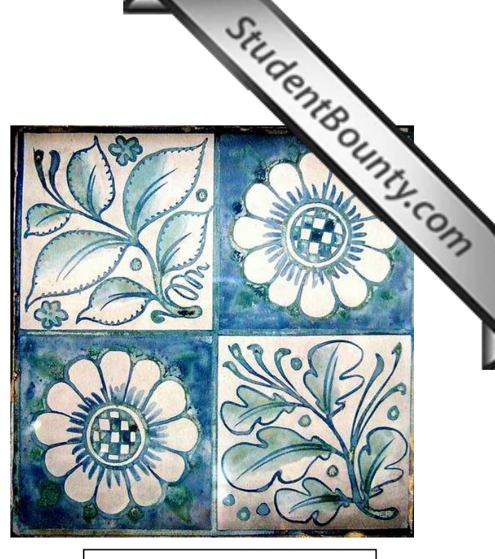
Fig. 1b – William Morris