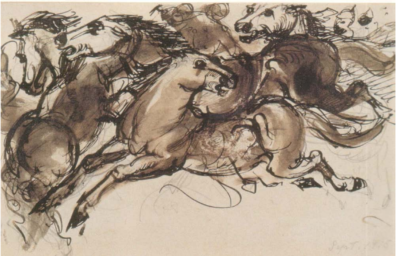
Figure 2: Rush of Horses – Franz Marc