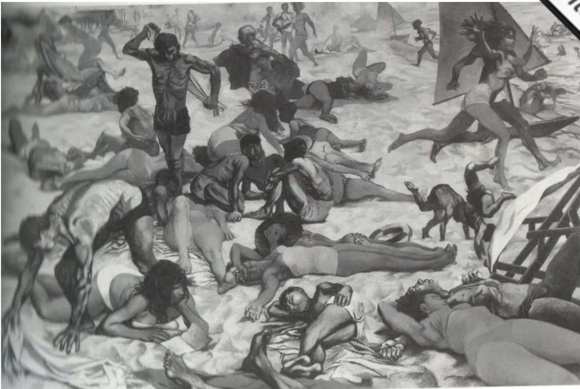
Figure 1: Beach – Renato Guttuso