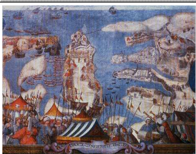
Source B. The Great Siege of Malta, 1565