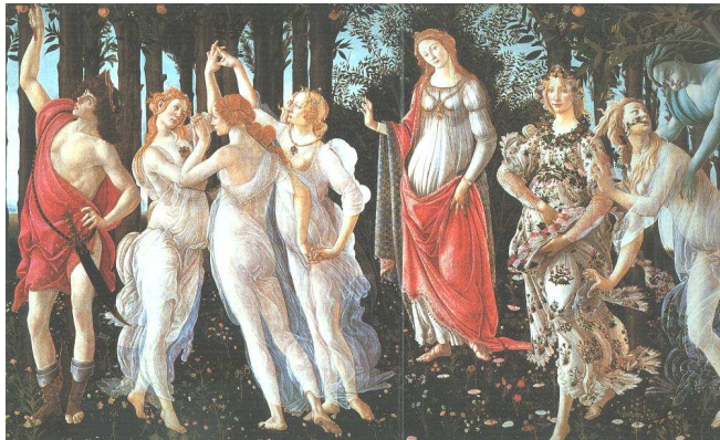
Source E. Spring , painting by Sandro Botticelli

4. Study carefully the following sources and then answer all the questions.