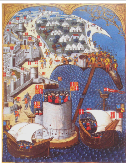
Source A. Siege of Rhodes, 1522

1. Look carefully at the following sources and then answer all the questions.