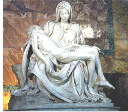
Source F. The Pietà , sculpture by Michelangelo

4.1 Sources E and F are about the ( Renaissance, Reformation, Industrial Revolution, Enlightenment ) (1)