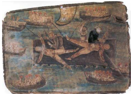
Source D. Execution of slaves in Malta in 1749 drawn by an amateur artist

2.1 State whether the above two sources are primary or secondary and explain why.