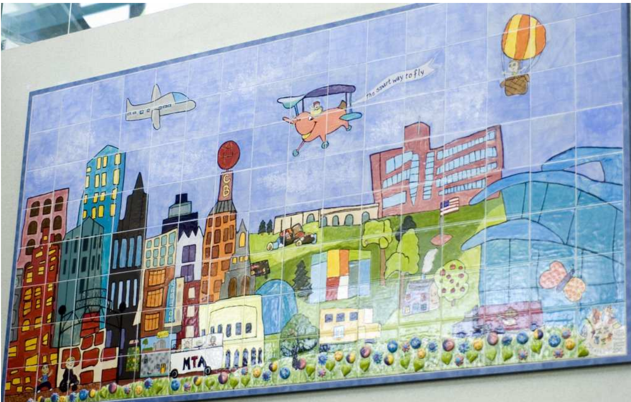
Figure 1: Bishop Mural