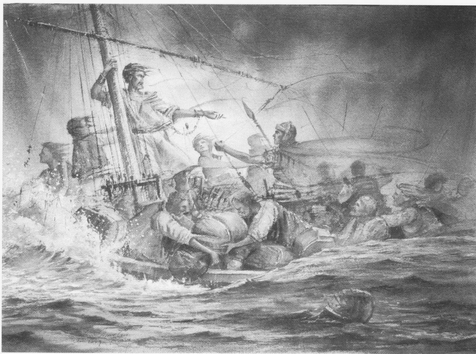
Figure 3: St. Paul's Shipwreck