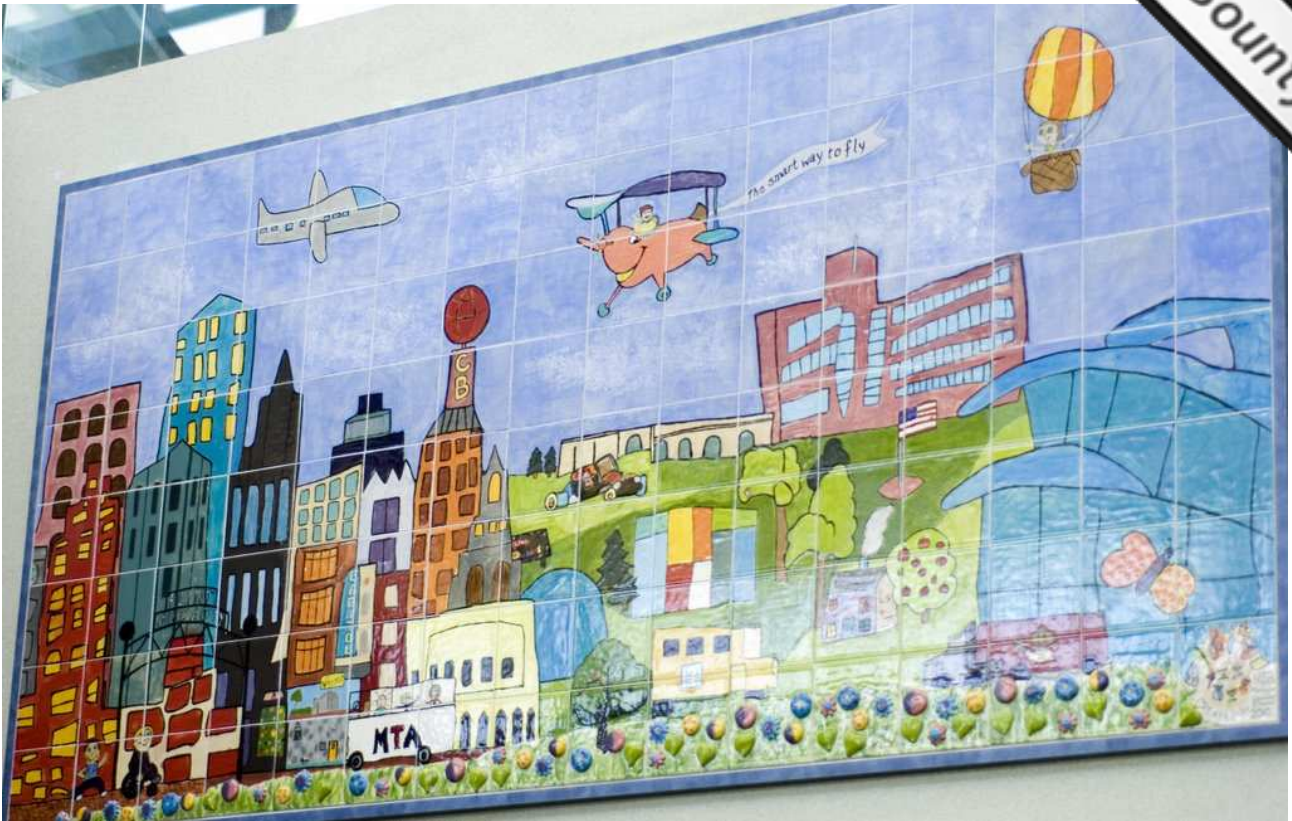
Figure 1: Bishop Mural