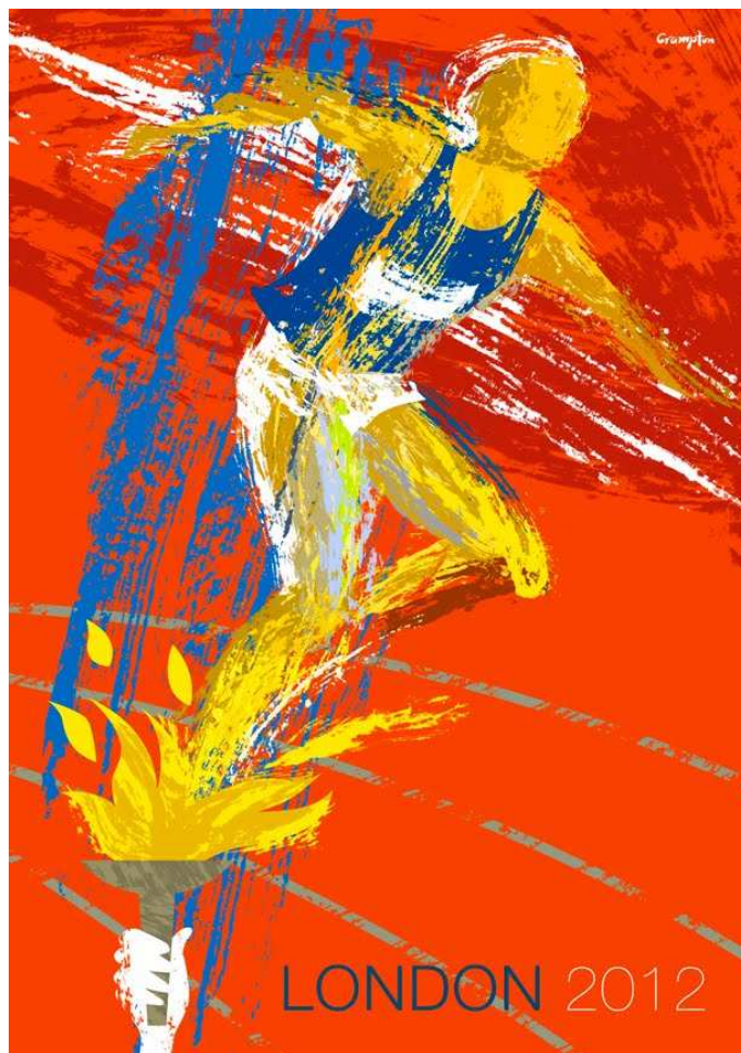
Figure 2: Olympic Poster – London 2012