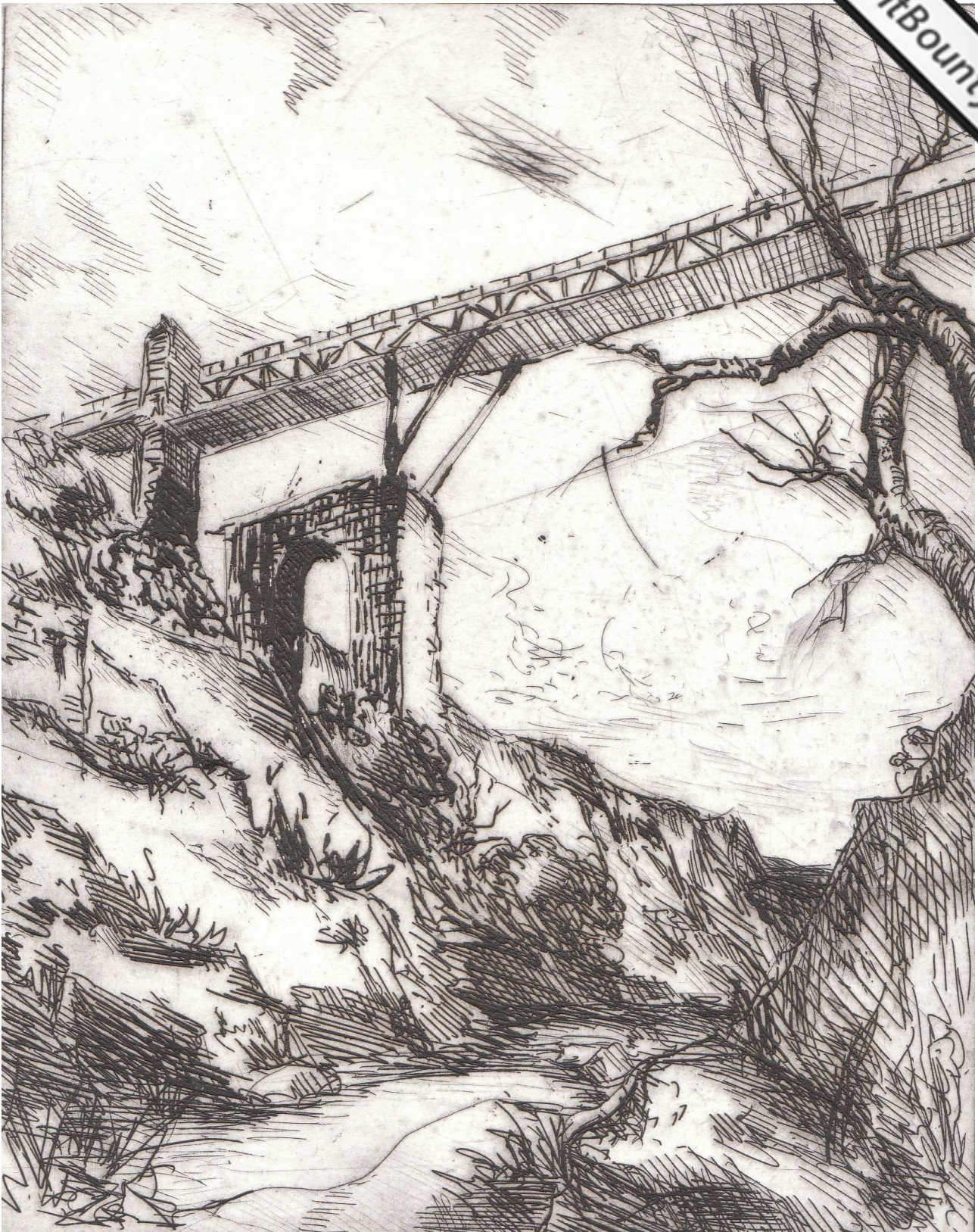
Figure 3: Mosta Steel Bridge – Carmelo Mangion