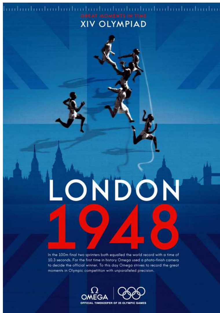
Figure 2: London 1948 – Olympic Games