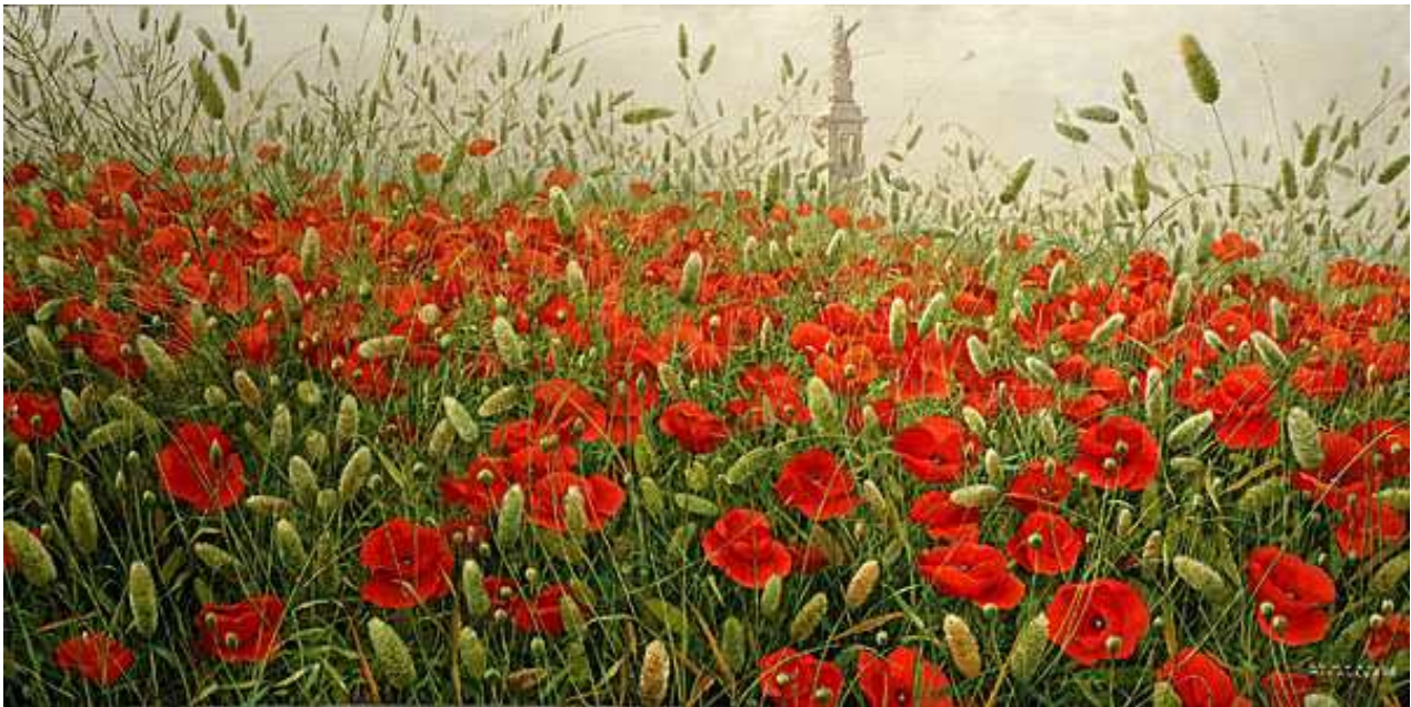
Figure 1: Poppy Perspective – Andrew Micallef