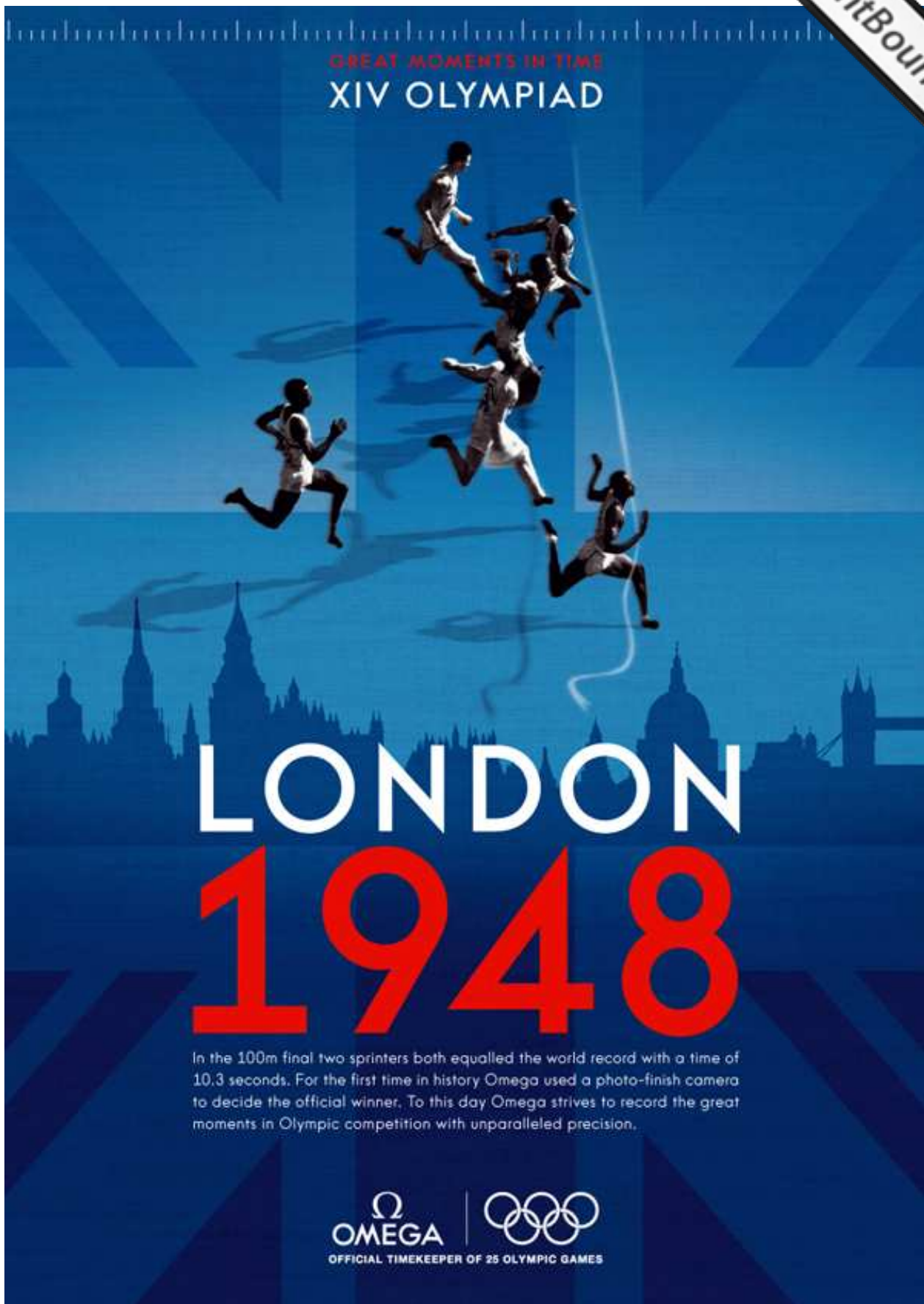
Figure 2: London 1948 – Olympic Games