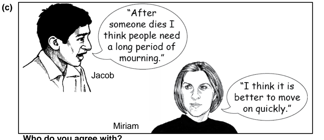
Who do you agree with? Give two reasons for your answer.