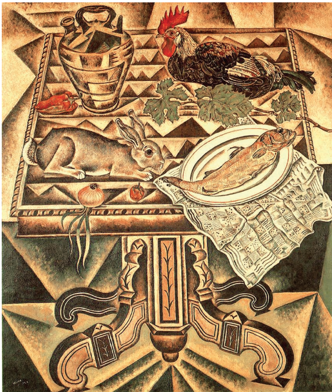
The Table (Still life with Rabbit) (1920) by Joan Miro oil on canvas (130 × 110 cm)