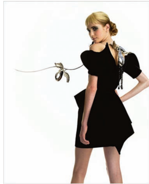
Neckpiece from her Catwalk Collection (2006) designed by Elizabeth Galton Materials: sterling silver and cut glass crystal.