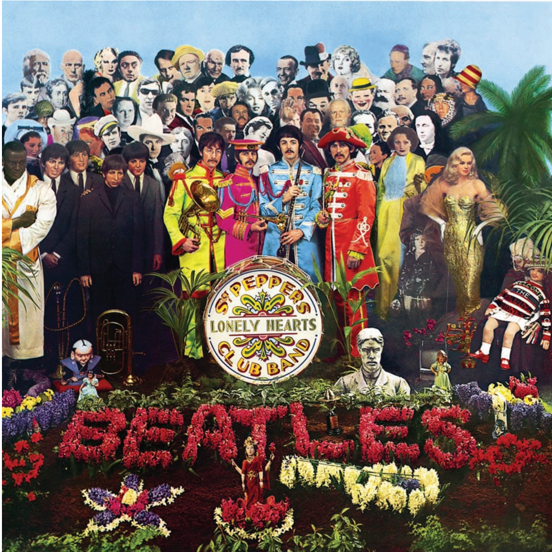
Sgt Pepper's Lonely Hearts Club Band album cover (1967) by Peter Blake and Jann Haworth (cover dimensions 31 × 31 cm)

Answer ONE full question from this section: parts (a) and (b) .