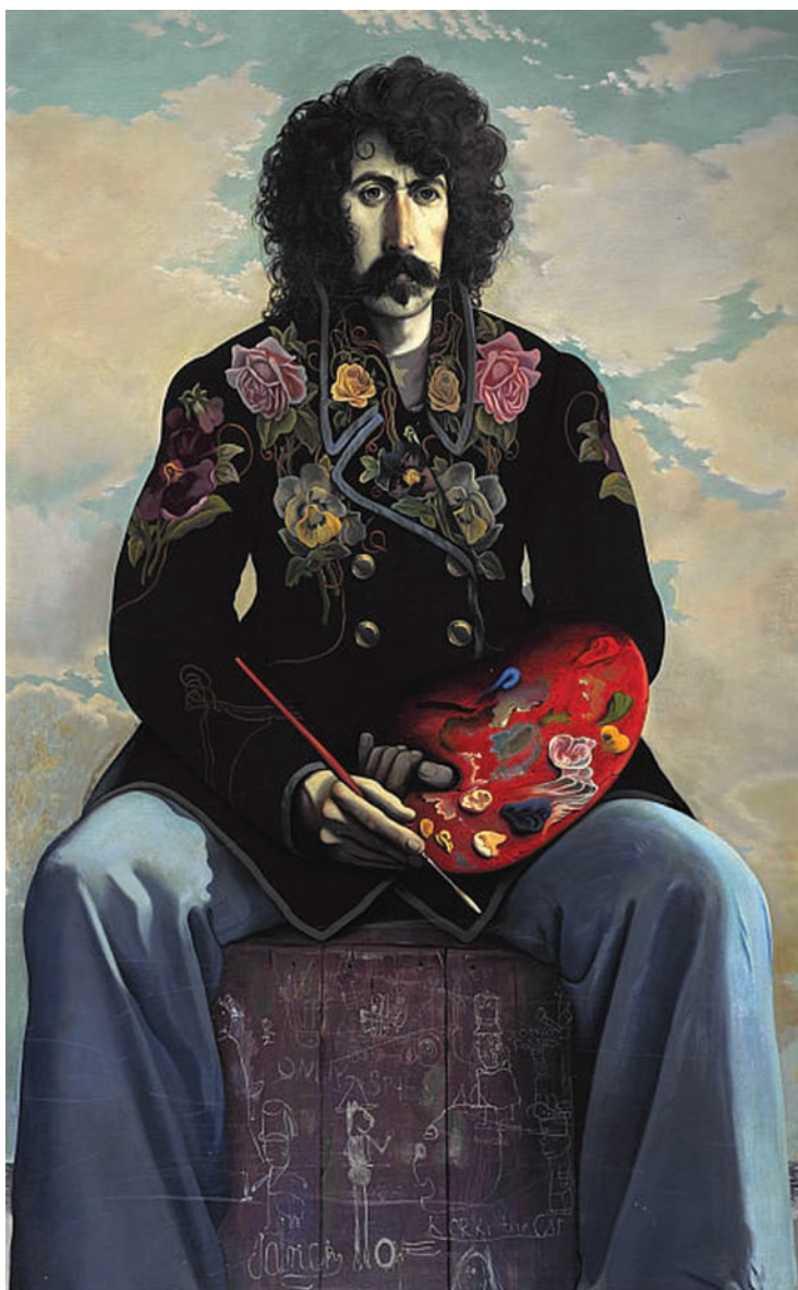
Self-portrait in a Flowered Jacket (1971–73) by John Patrick Byrne oil on board (147 × 91 cm)

Answer ONE full question from this section: parts (a) and (b) .