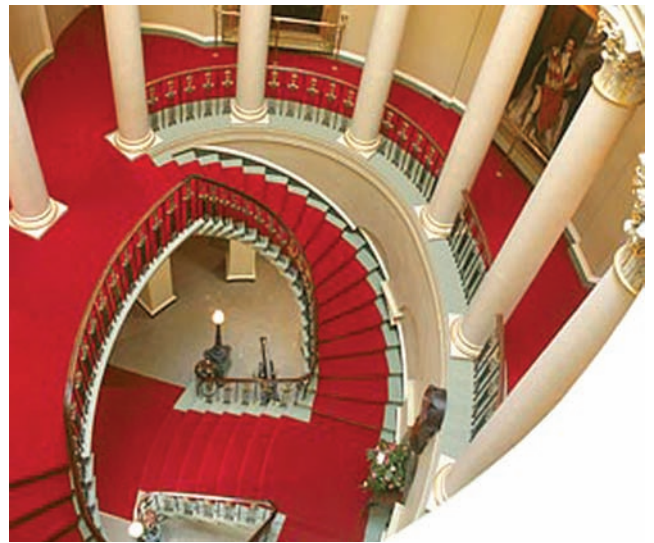
Saloon and oval staircase in Culzean Castle (1772–1792), designed by Robert Adam