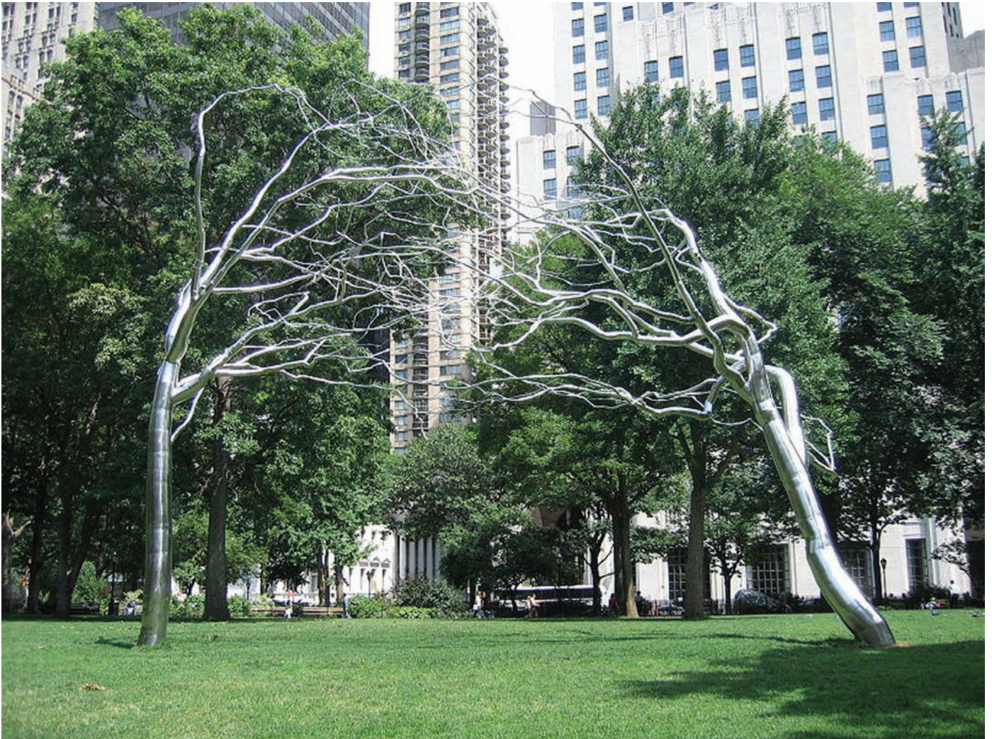
Conjoined 1 – Madison Square Gardens New York City (2007) by Roxy Paine stainless steel (12m 19cm × 13m 72cm)

1 Conjoined – to join or become joined together