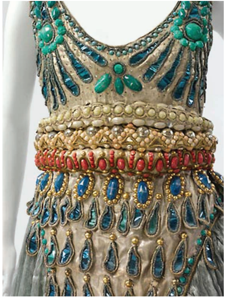
Outfit (1911) designed by Paul Poiret Materials: silk decorated with blue metallic foil and beaded embroidery.