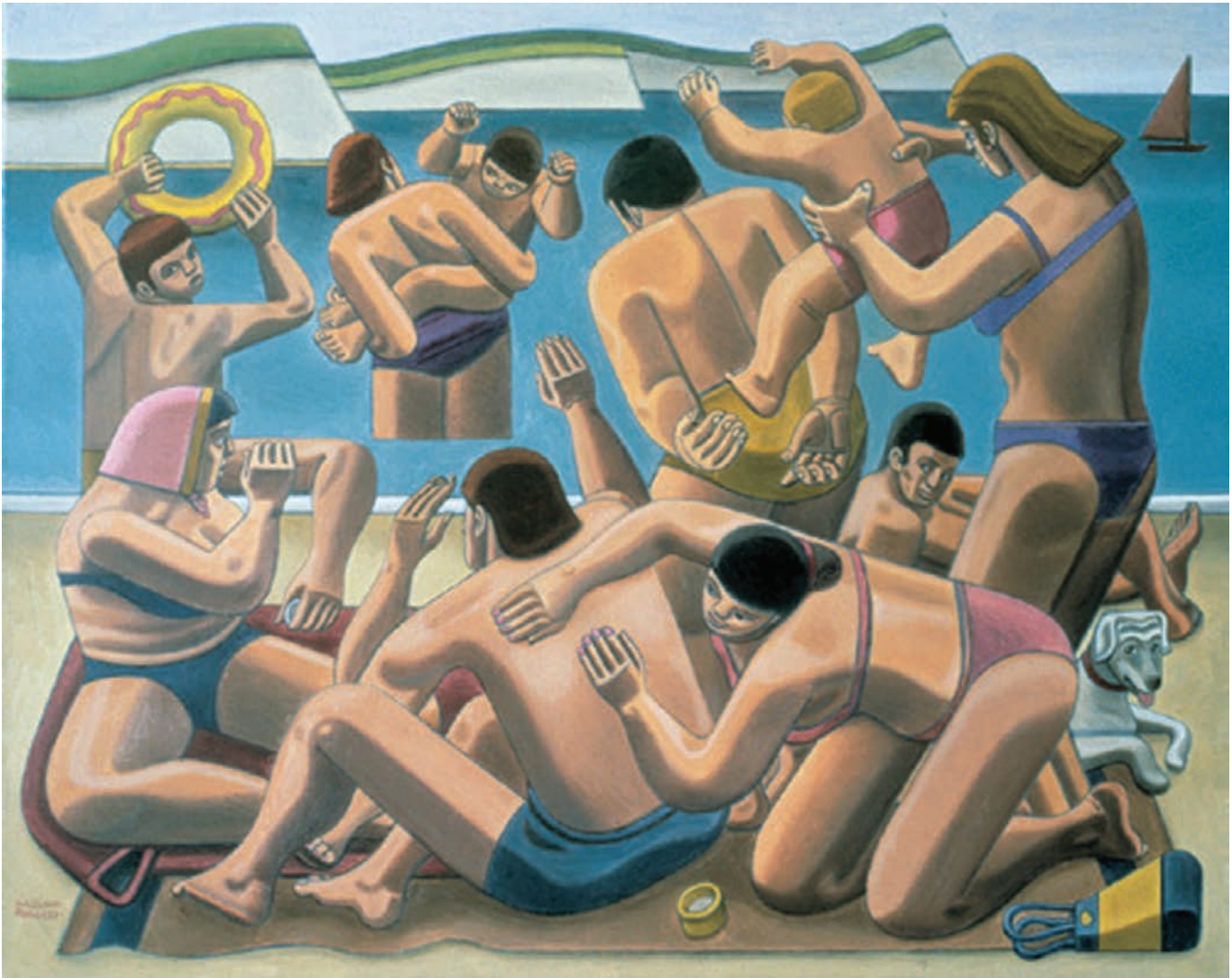
The Seaside (1966) by William Roberts oil on canvas (61 × 76 cm)