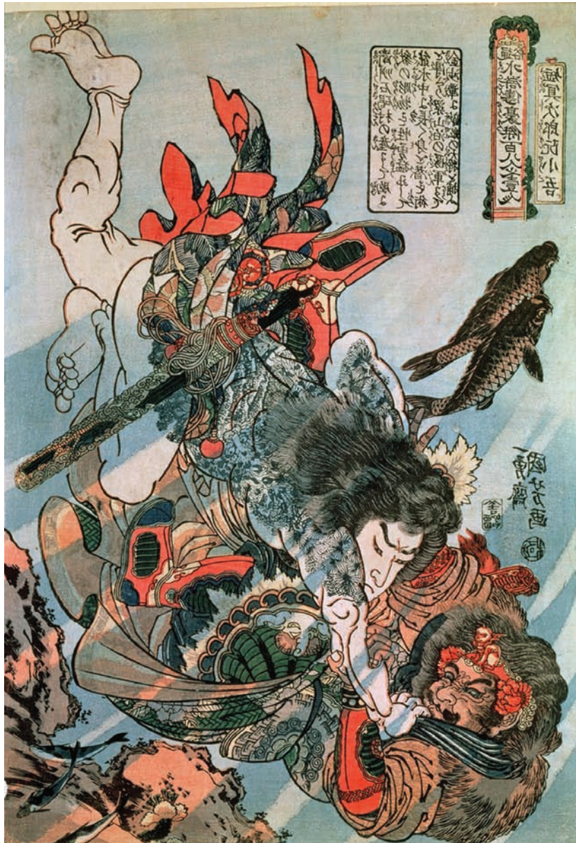
Tameijiro dan Shogo grapples with his enemy under water (1828-29) by Kuniyoshi woodblock colour print (36 × 25 cm)