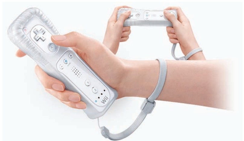
Wii home video games console (2006) designed by Nintendo approximate cost £149 (Jan 2012)