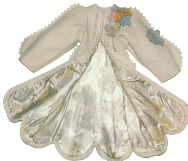
Dinosaur coat and hat designed by Zandra Rhodes (1971). Materials: wool felt, printed silk lining and appliqué silk flowers.