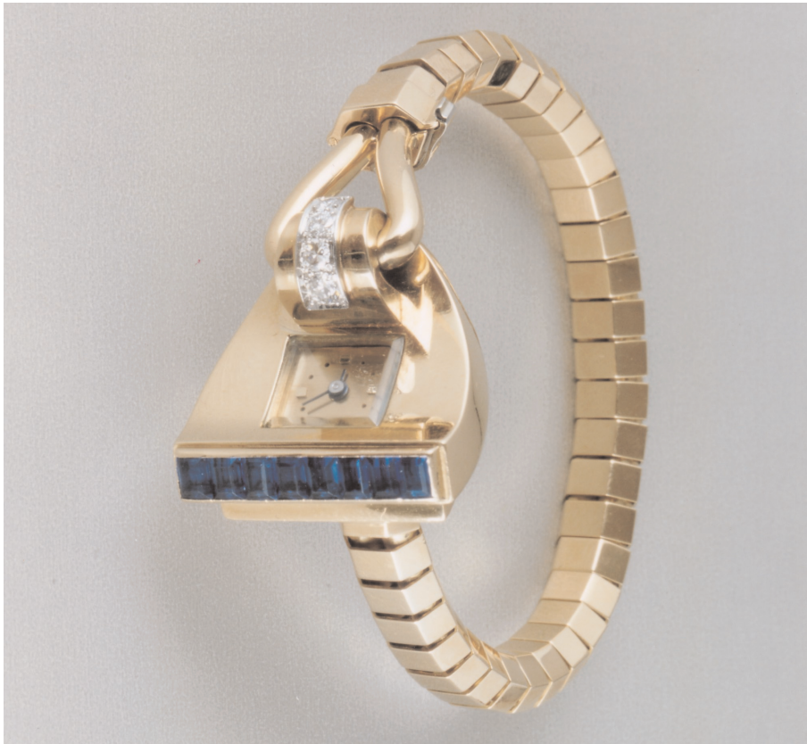
Wrist watch by Boucheron (1942). Materials: gold set with diamonds and sapphires.