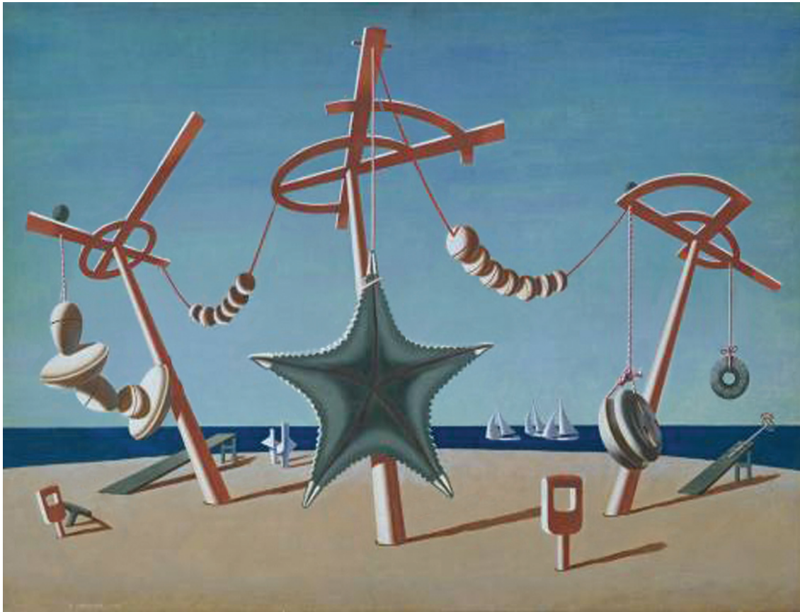
The Beached Margin (1937) by Edward Wadsworth, tempera paint on linen (71 × 101 cm)