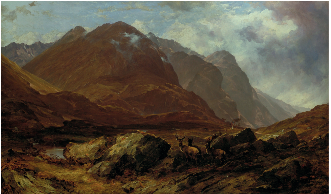
Glencoe (1864) by Horatio McCulloch, oil on canvas (110 × 183 cm)