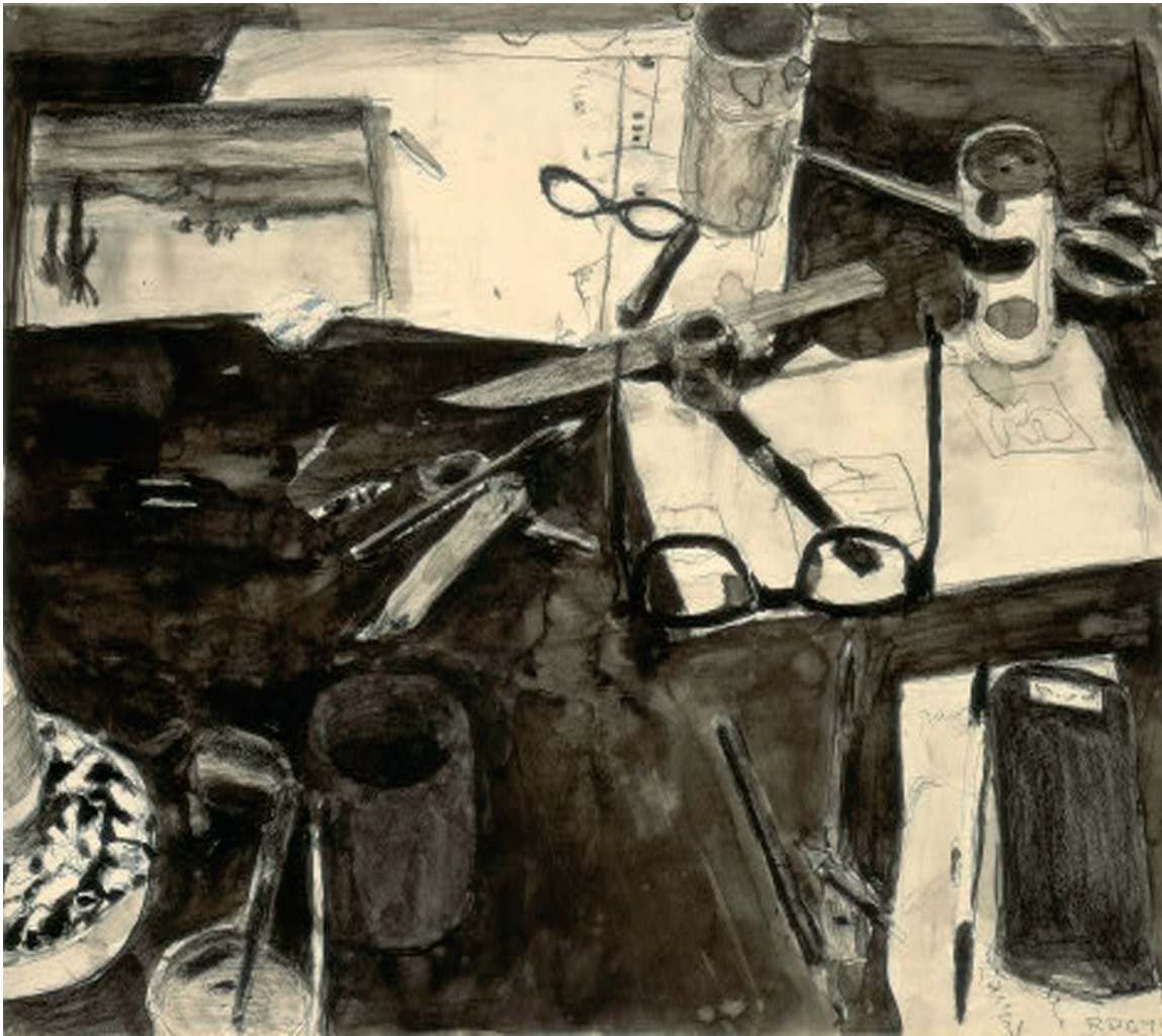
Still Life (1967) by Richard Diebenkorn, black ink, Conté crayon, charcoal and ball-point pen on paper (35.2 × 42.5 cm)