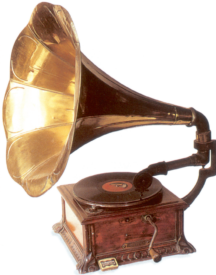
Gramophone designed for Pathé (1908), height 67 cm.

This early music system is operated by a clockwork mechanism which requires the user to wind up the handle.