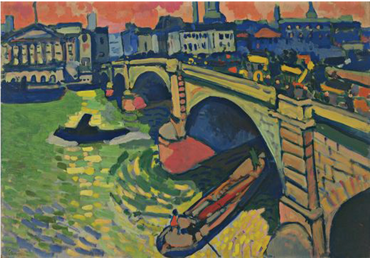
London Bridge (1906) by Andre Derain, oil on canvas (66 × 99 cm)