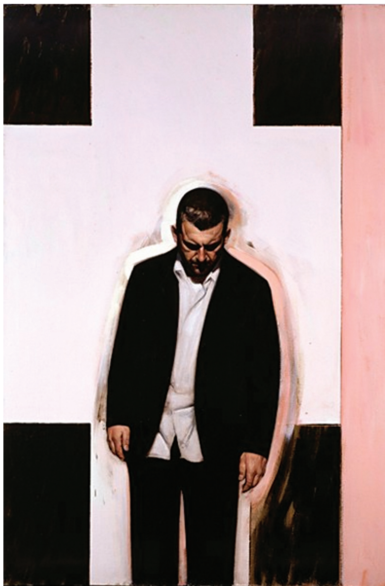
Self Portrait (2005) by Stephen Conroy, oil on canvas (207 × 147 cm)

Answer ONE full question from this section: parts (a) and (b) .