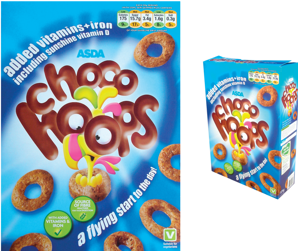
Breakfast cereal packaging design for ASDA (2007)

Answer ONE full question from this section: parts (a) and (b) .