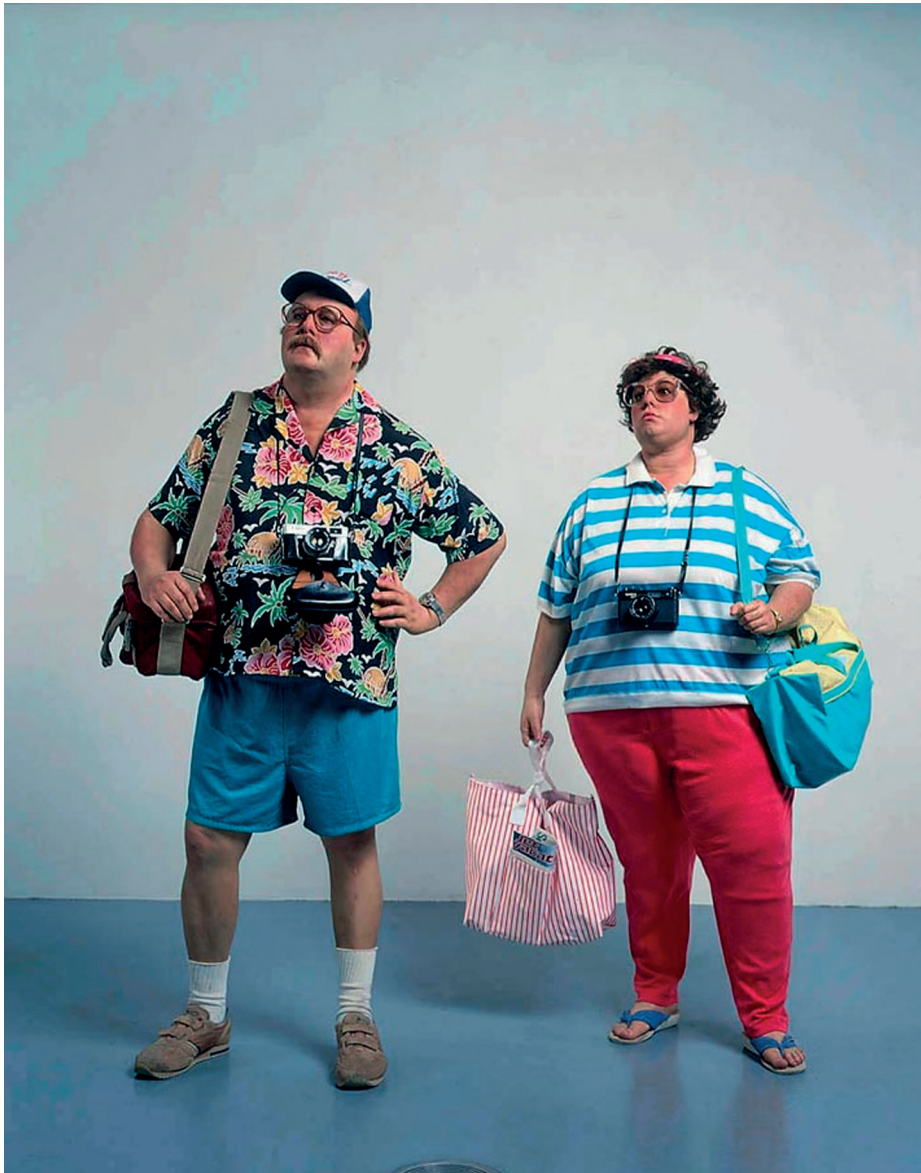
Tourists II (1988) by Duane Hanson, the figures are lifesize.

This sculpture is made of autobody filler, fibreglass and mixed media with real clothes and accessories.