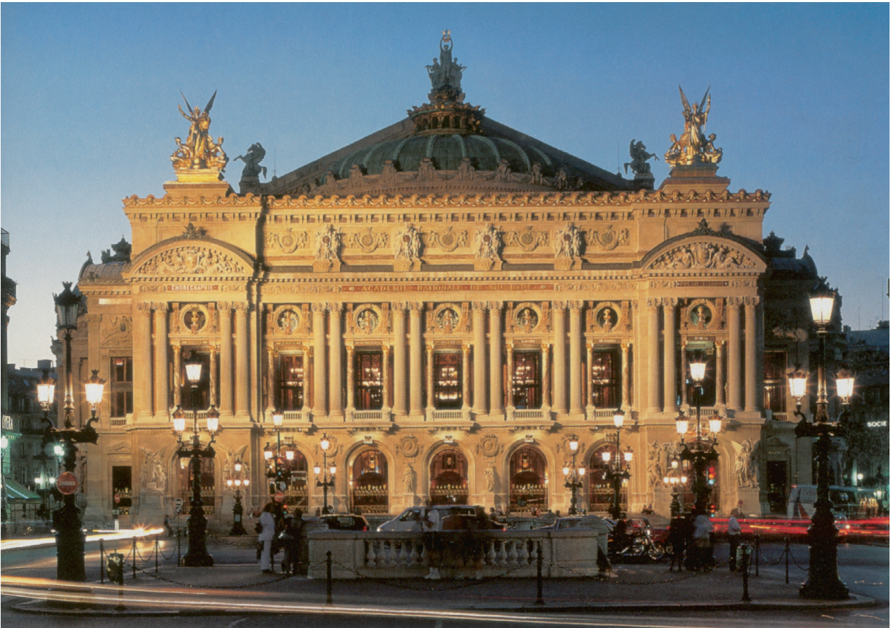
The Opera House, Paris, designed by Charles Garnier (1861–1875)