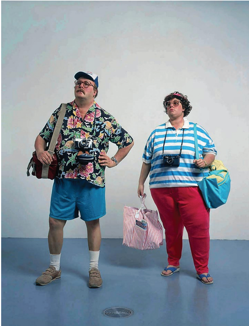
The Tourists II (1988) by Duane Hanson

This life-size sculpture is made of autobody filler, fibreglass and mixed media with real clothes and accessories.