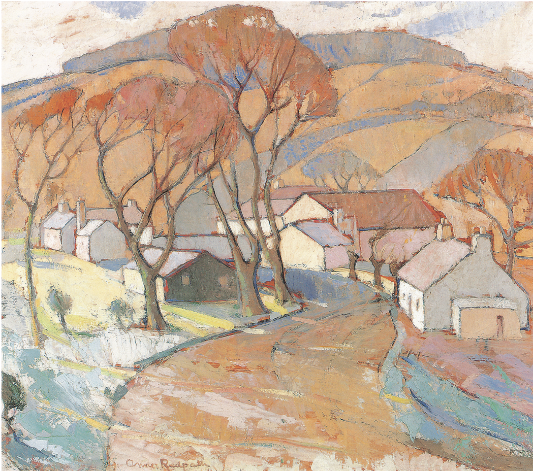
Frosty Morning, Trow Mill (1936) by Anne Redpath Oil on plywood (81.3 x 91.4 cm)