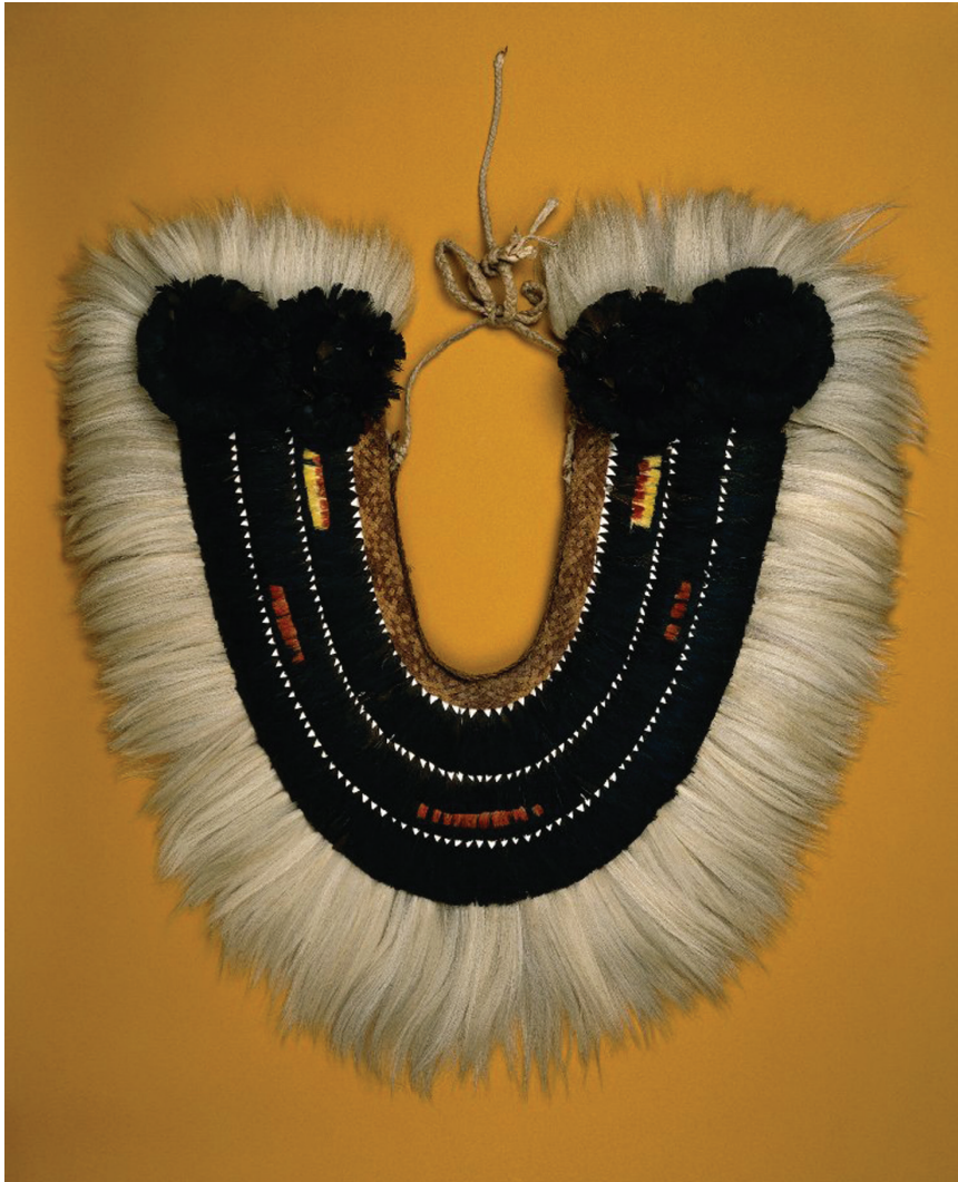
Breastplate from Tahiti (c. 1753) by an unknown designer Materials: coconut fibre with feathers, shark teeth and dog hair (height 52 cm, width 59 cm)