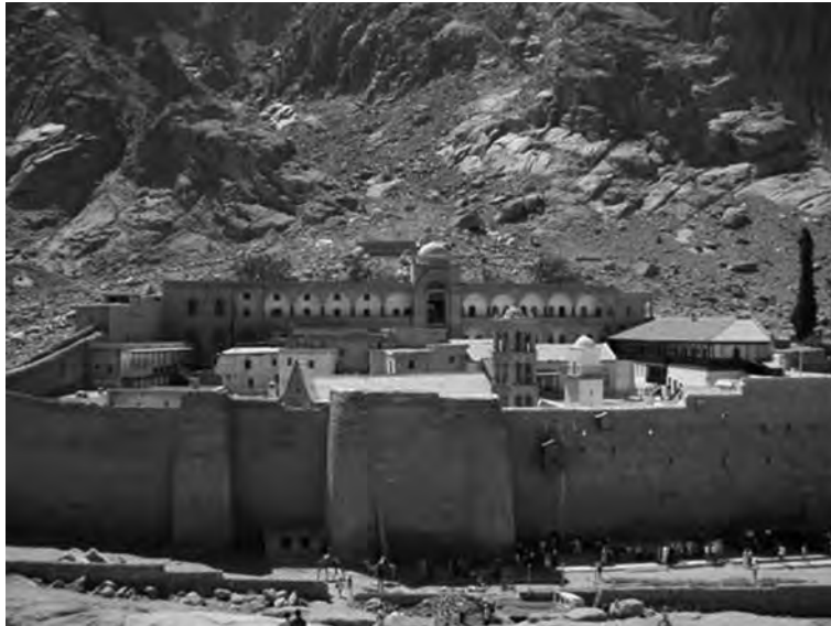
Fig. 4 for Question 4

St. Catherine's Monastery is an Orthodox monastery on the Sinai peninsula at the base of Mount Sinai in Egypt. One of the oldest Christian monasteries in the world, St. Catherine's includes the burning bush seen by Moses and contains many valuable religious icons. This area is sacred to three world religions: Christianity, Islam and Judaism.