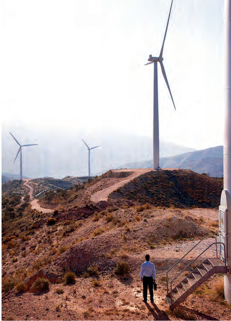
Photograph D for Question 4