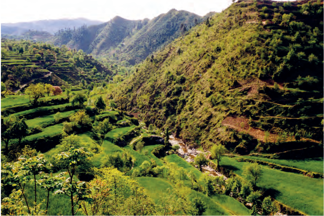
Photograph C for Questions 3 and 4