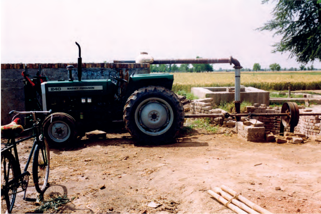
Photograph A for Question 1