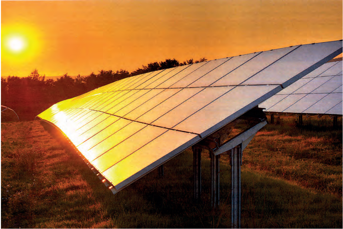
Photograph E for Question 4