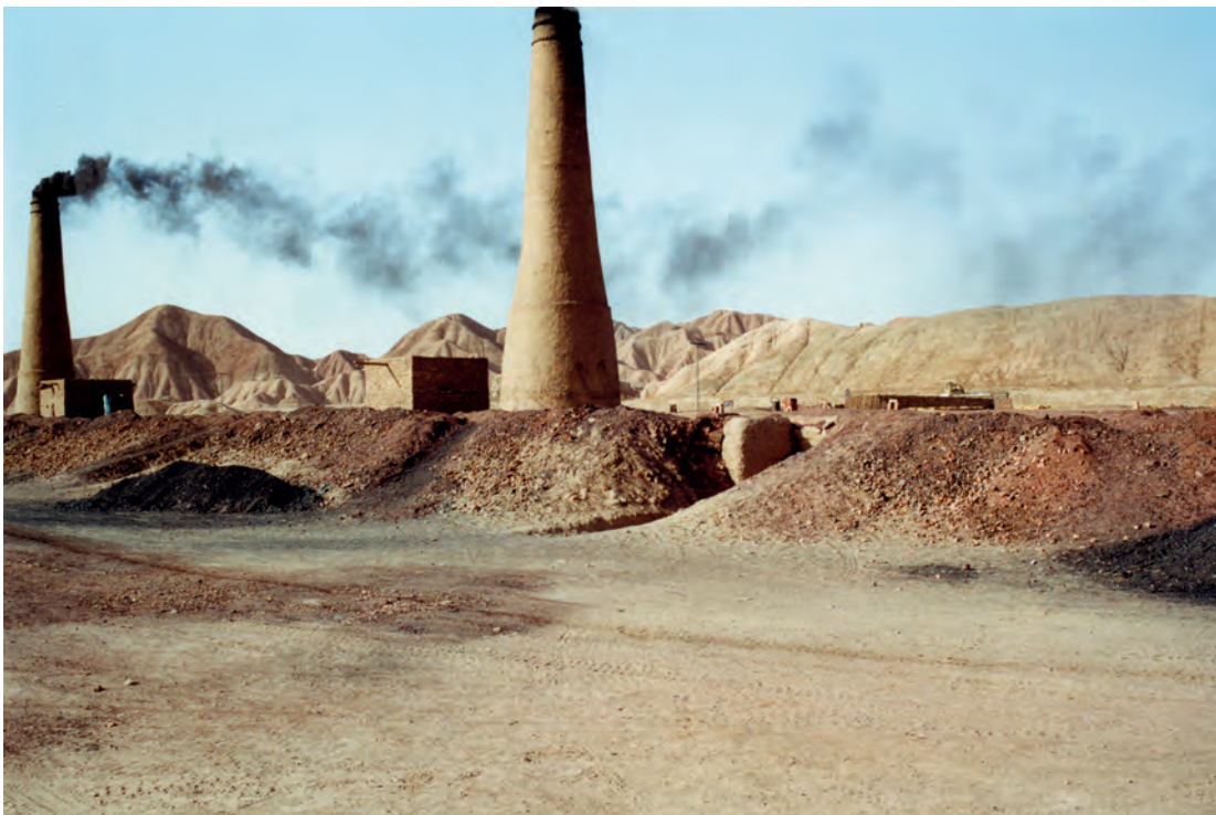
Photograph B for Question 2