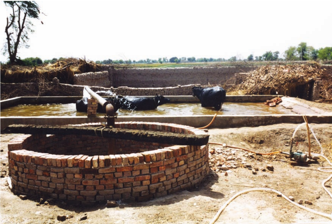
Photograph B for Question 2