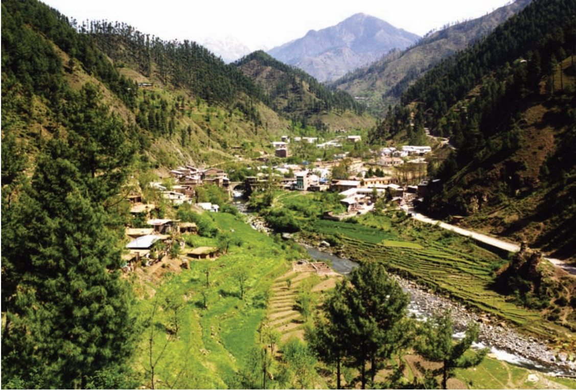
Photograph C for Question 3