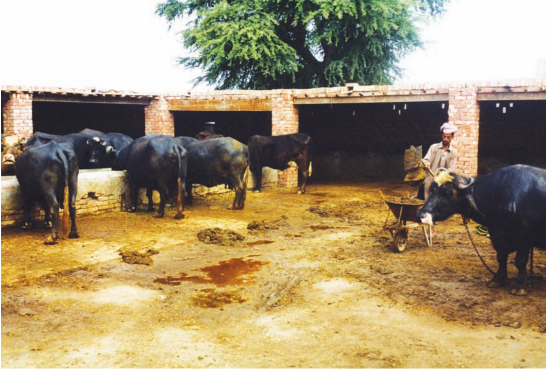
Photograph A for Question 2