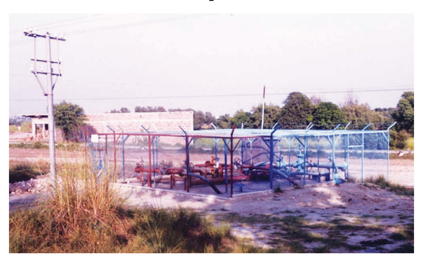
Photograph B for Question 4(c)