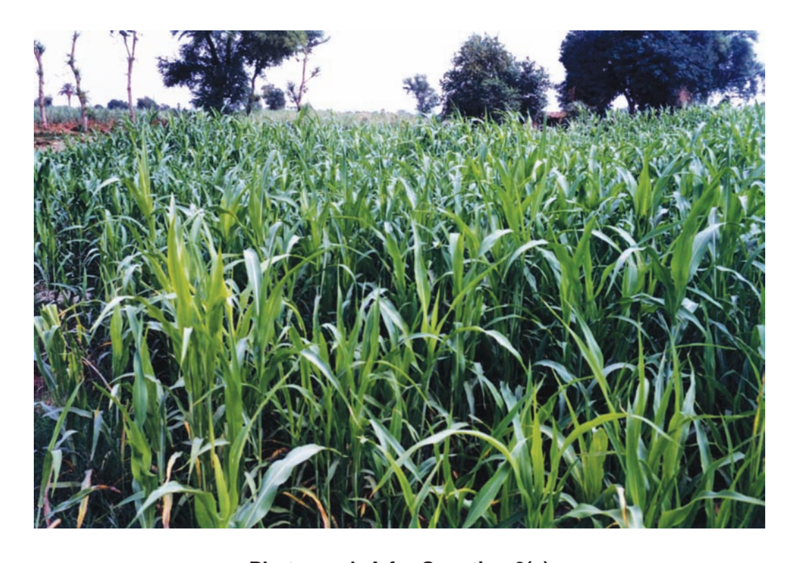
Photograph A for Question 2(a)

This document consists of 2 printed pages.