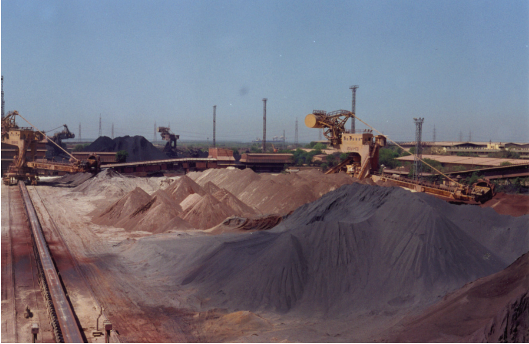
Photograph C for Question 4