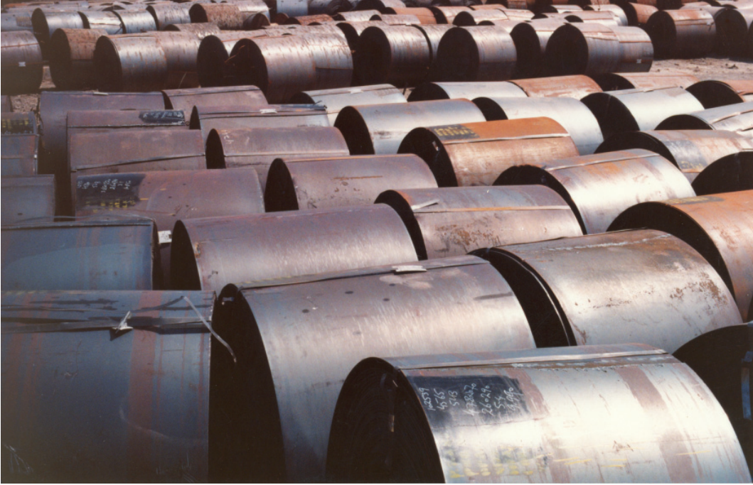
Photograph E for Question 4