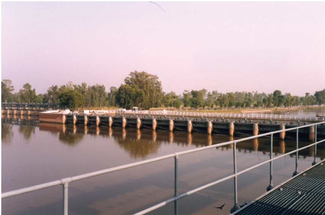
Photograph B for Question 1