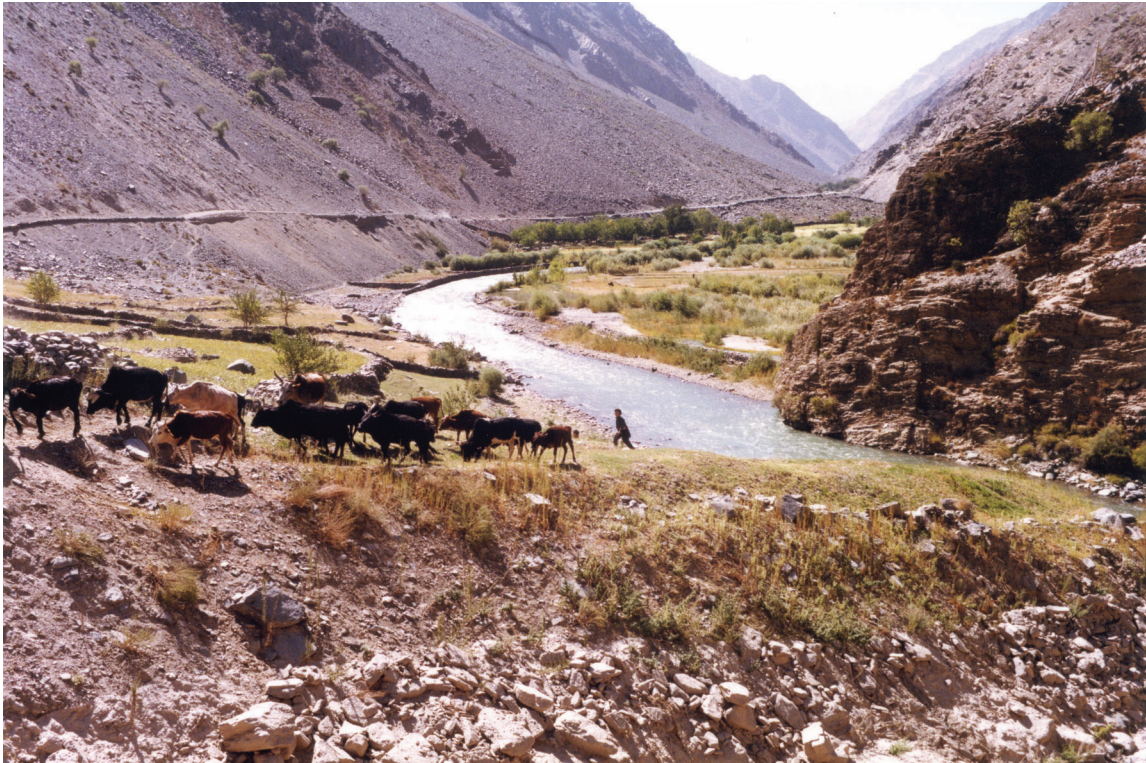
Fig. 3 for Question 2