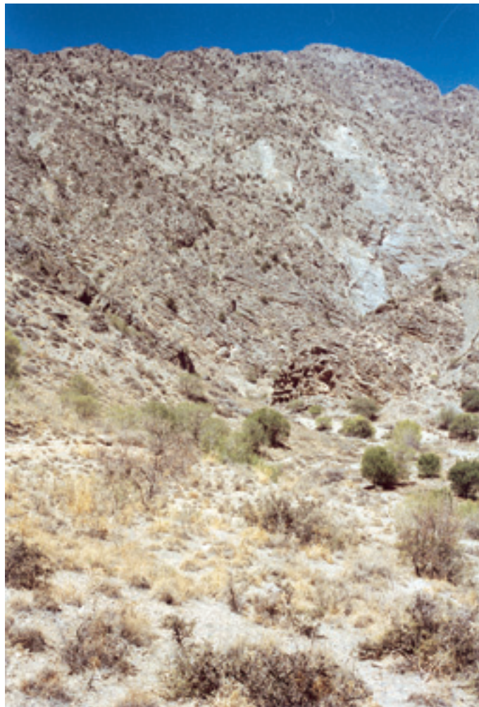
Hazarganji-Chiltan National Park, near Quetta