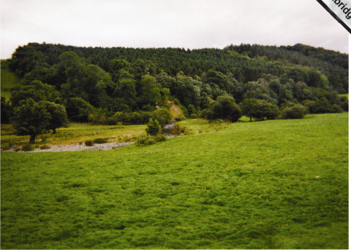
Photograph A for Question 3