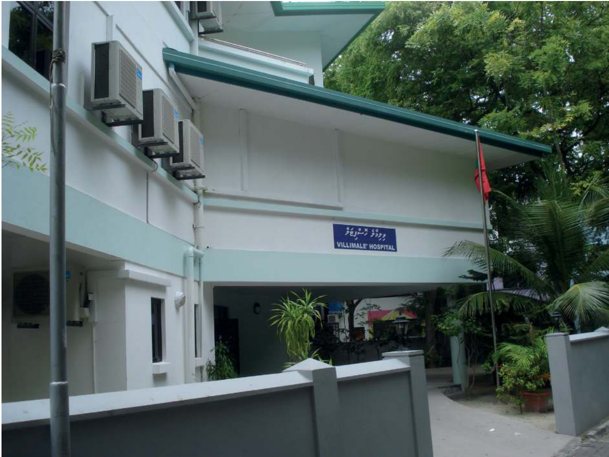
Fig. 2.2 for Question 2