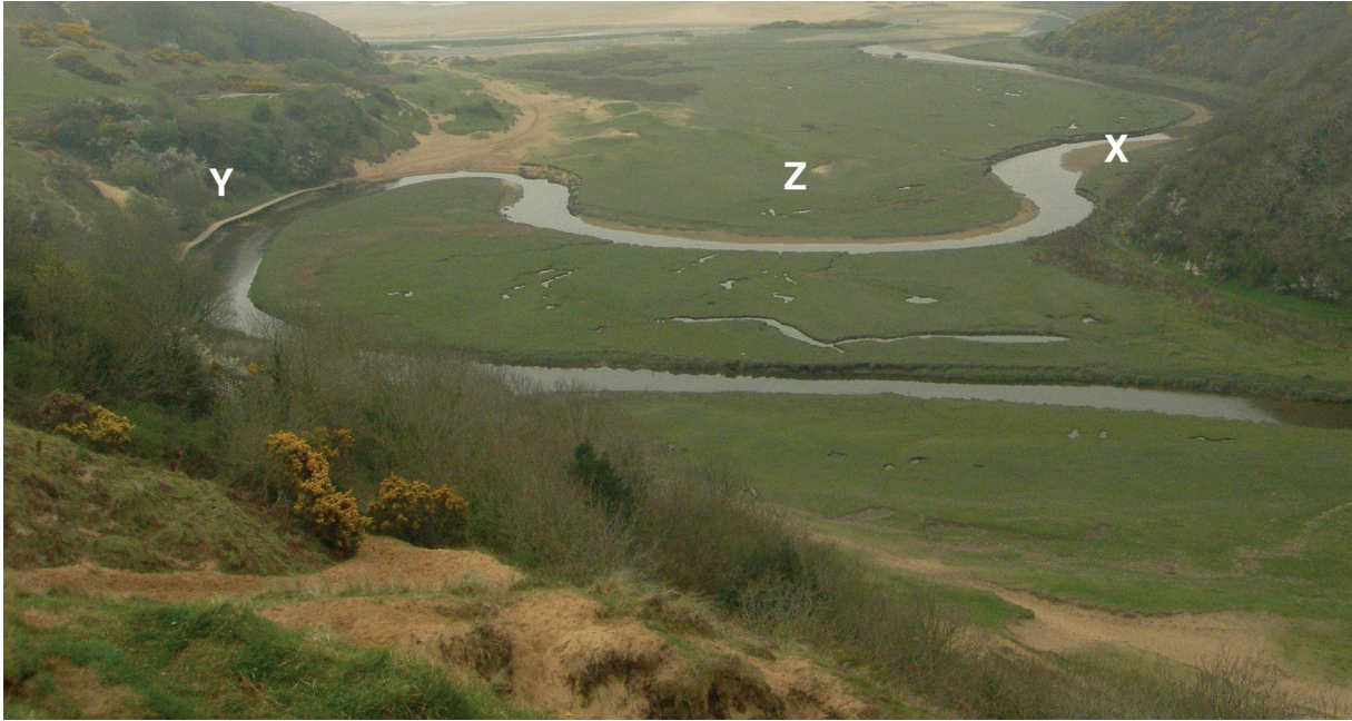
Photograph A for Question 3