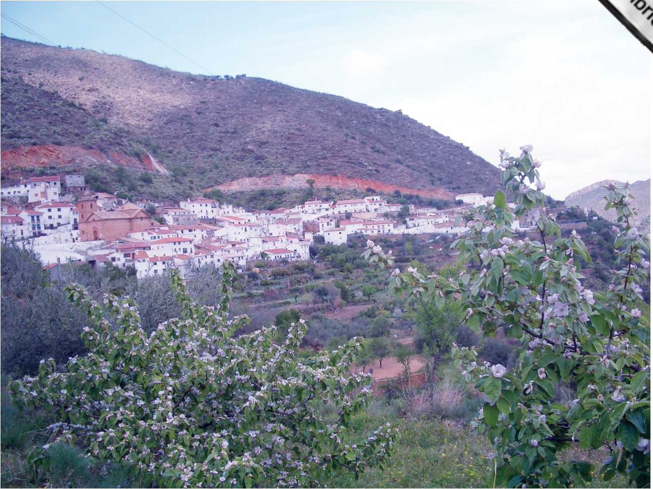
Photograph A for Question 2