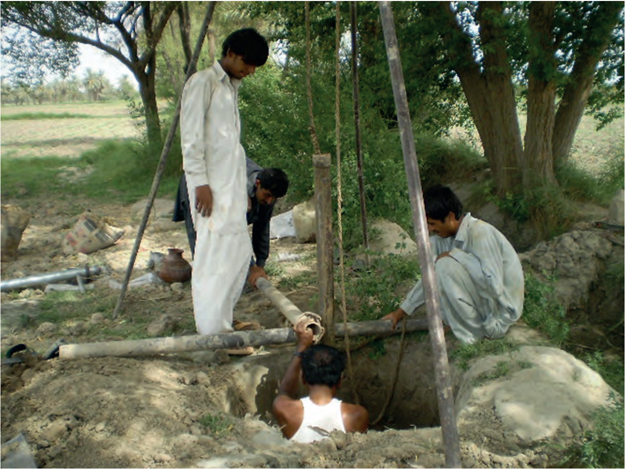
Photograph A for Question 5