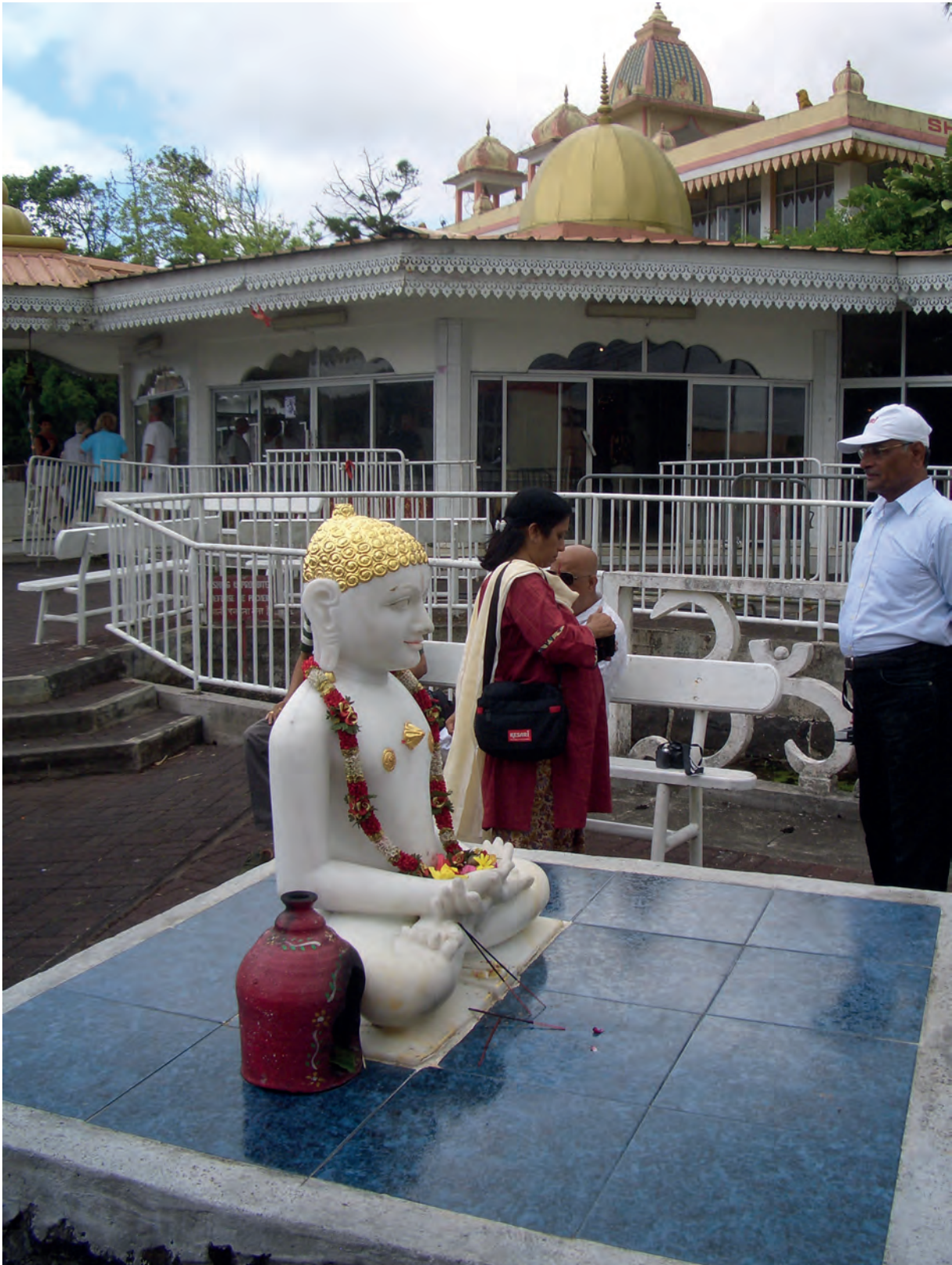
Photograph A for Question 6