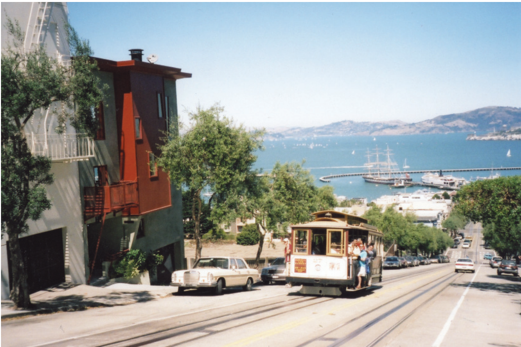
Photograph C for Question 3 is on page 4