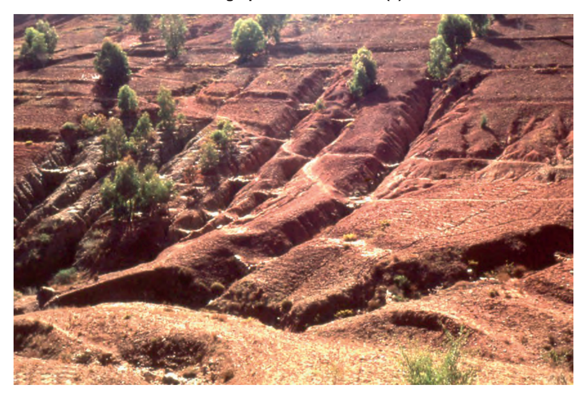
Photograph B for Question 6(c)