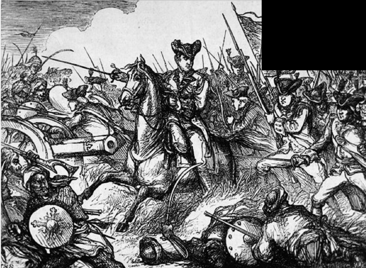
An eighteenth-century British print of the Battle of Palashi (Plassey)

During the war with France, which broke out in 1756, the British used internal divisions in Bengal to their advantage. They weakened the position of Sirajuddaula and when the disputes between the Nawab and the British led to conflict, it was the East India Company that was victorious. The decisive battle took place at Palashi in 1757. The British installed a puppet ruler in Bengal. British influence was extended by the acquisition of three districts in 1760 and by gaining the right to collect revenue. A treaty of 1765 allowed Bengal to be ruled by collaborators with the British in return for surplus revenues, but the rule of the Company did little for the people of Bengal. There was considerable hardship in the Great Famine of 1769–1770 and as a result of reforms to Company rule, such as the Permanent Settlement of 1793.