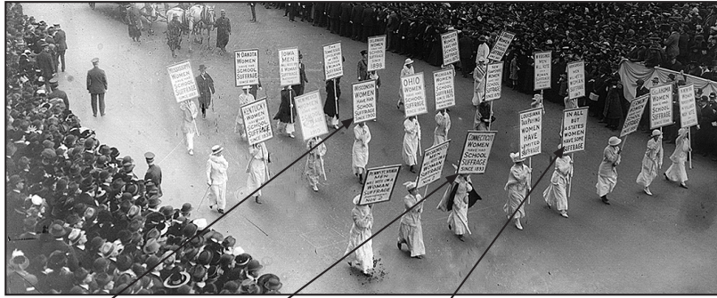
Suffragists' Parade, c. 1913