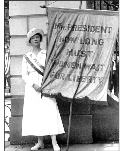
White House Picketeter, 1917

Source: Miles Harvey, Women's Voting Rights , Children's Press