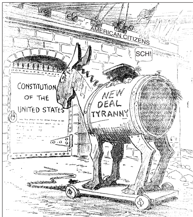
Source: Carey Orr, The Chicago Tribune , September 17, 1935 (adapted)