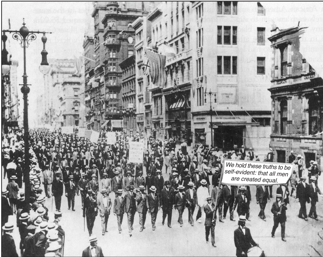
Parade in New York City sponsored by the NAACP in 1917