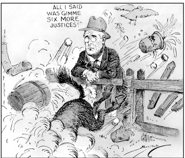
Source: Clifford Kennedy Berryman, The Washington Star , March 9, 1937

Base your answer to question 28 on the cartoon below and on your knowledge of social studies.