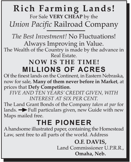
- 19th-century broadside (adapted)

5 According to the suggestions in this advertisement, how did railroads encourage settlement of the West? [1]