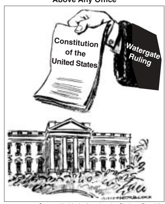
Source: Herblock, America, the Glorious Republic , Houghton Mifflin Co.