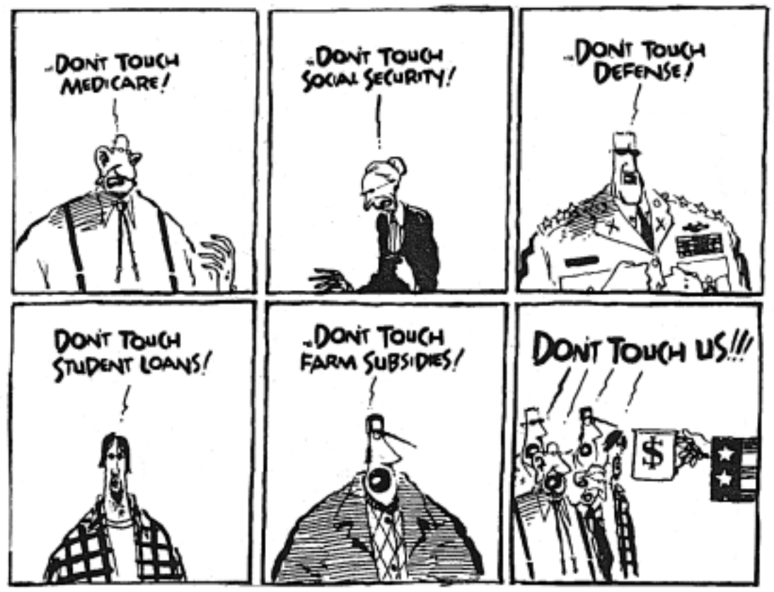
Ohman, Portland Oregonian

Base your answers to questions 37 and 38 on the cartoon below and on your knowledge of social studies.