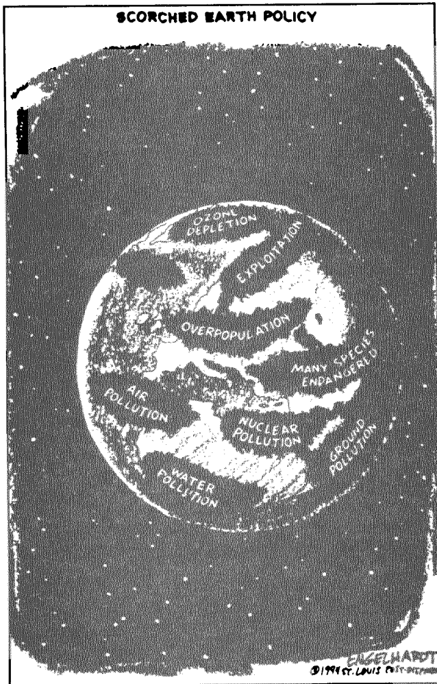
Monday, May 30, 1994, Press & Sun-Bulletin (adapted)

Base your answer to question 43 on the cartoon below and on your knowledge of social studies.