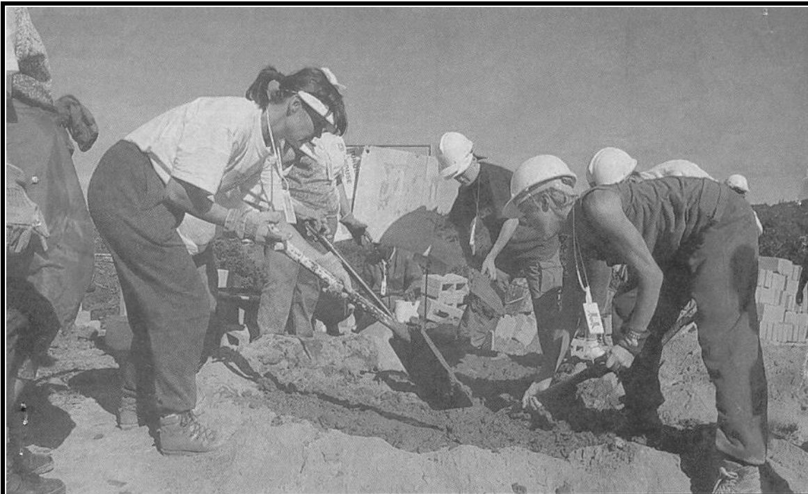
YIBO laba besifazane bezibambele mathupha bexova usimende besembhidlangweni w okwakha izindlu.