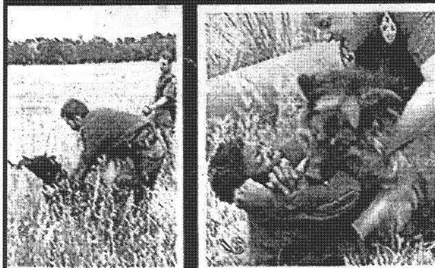
LEZI ngezinye zezithombe ezathusa umhlaba wonke ngesihluku samaphoyisa ayelumisa izifiki ngezinja.