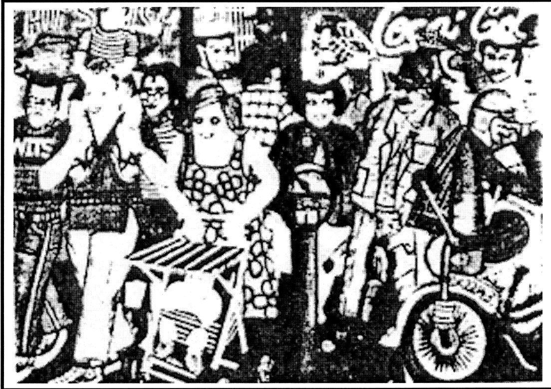
Tommy Motswai Faces at Christmas 1988 Pastel on paper 141 x 211 cm PC

In haar Art in Outline (Vol. 1) verwys Merle Huntley na hedendaagse Suid-Afrikaanse Kuns as 'n 'smeltpot' en kies Tommy Motswai se tekening Gesigte met Kersfees as 'n goeie voorbeeld van wat bedoel word met 'n 'smeltpot' .