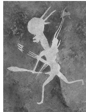
FIGURE 9: San rock painting

Nearly all early art from different cultures was created for ritualistic or religious requirements and wish fulfillments, often referred to as ' magic-religious ' needs.