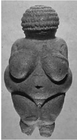
FIGURE 7: Venus of Willendorf