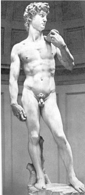
FIGURE 5: Michelangelo, David , Marble

The pictures below represent TWO of Michaelangelo's artworks.