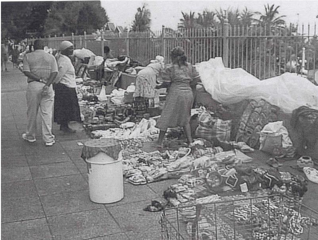
FIGURE 4: Street vendors in South Africa

Write an article to your local newspaper in which you strongly criticise your municipality's attempts to remove the arts and crafts made or sold by the street vendors, from your town, city or area.