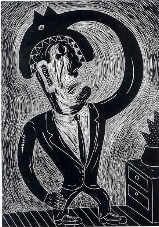
FIGURE 2: Norman Catherine Man Eater and Shark Eater, (detail)