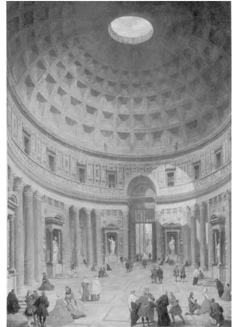
FIGURE 11: Roman Temple, Pantheon , Rome

6.1 The Parthenon (FIGURE 10) and the Pantheon (FIGURE 11) are temples built by two of the most powerful ancient civilizations in Western culture.