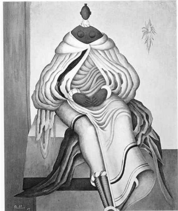
FIGURE 13: Alexis Preller, Mapogga Woman , Painting

Read the following then answer the questions that follow: