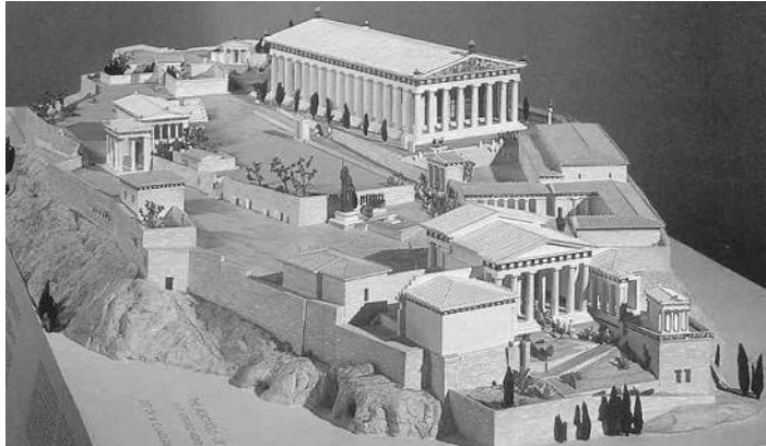
FIGURE 10: Greek Temple, Parthenon , 448-432, Acropolis, Athens