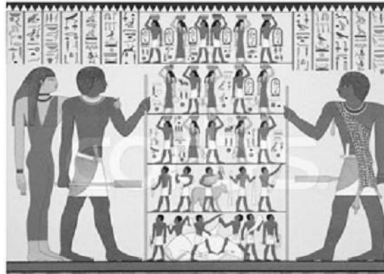
FIGURE 8: An Egyptian painting depicting a ceremony