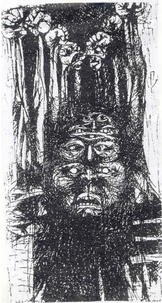
FIGURE 14: Untitled , Dumile Feni, Drawing.

7.3 Read the following and study FIGURE 14: