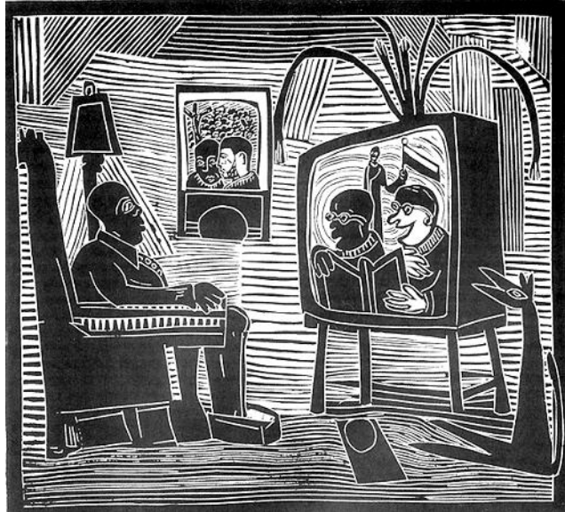
FIGURE 3: Azaria Mbatha, The News, Linocut