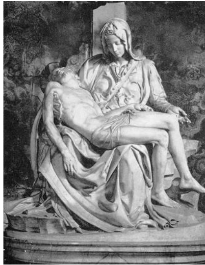
FIGURE 6: Michelangelo, The Pieta , Marble

4.1 Sculptors use a visual and tactile language. They may create works in order to make a statement. What do you think Michelangelo is 'saying' in these sculptures? Refer to FOUR of the following as guidelines in your discussion.