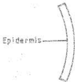
Piece in L_1

The appearance after 20 minutes is as shown.