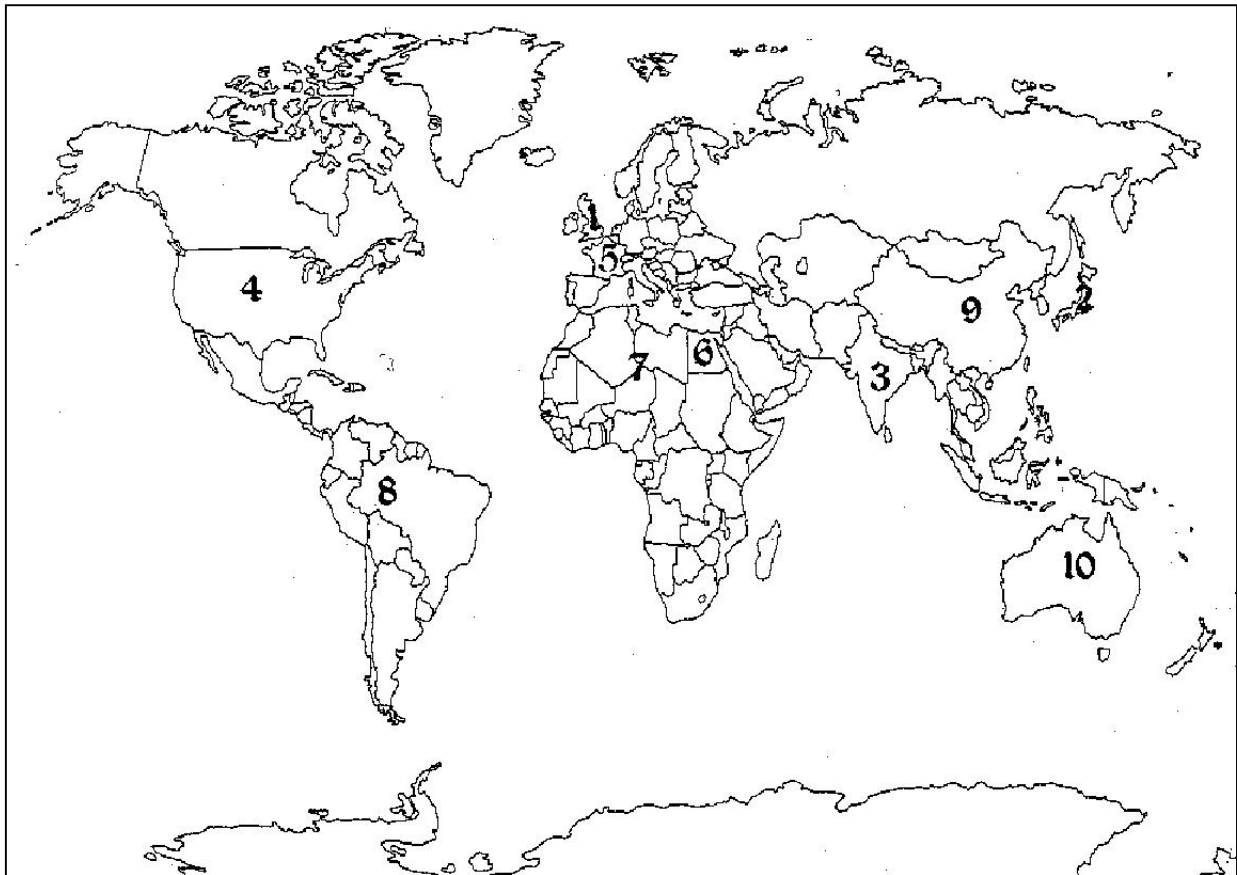
The World Map