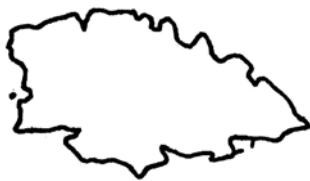
Figure 1: Shapes

1. Figure 1 includes shapes of five places and one object as seen from above. Name them in the space provided under each: (6 marks)