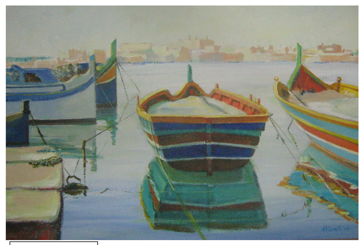
Figure 2 'Boats at Sea' by Alfred Portelli