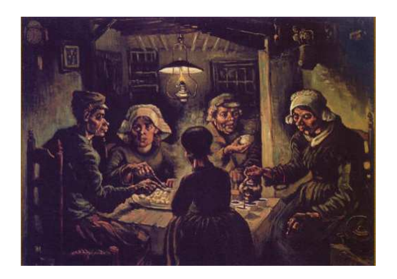
Figure 2 The Potato Eaters by Vincent van Gogh

Figure 1 People Dancing by Antoine Camilleri