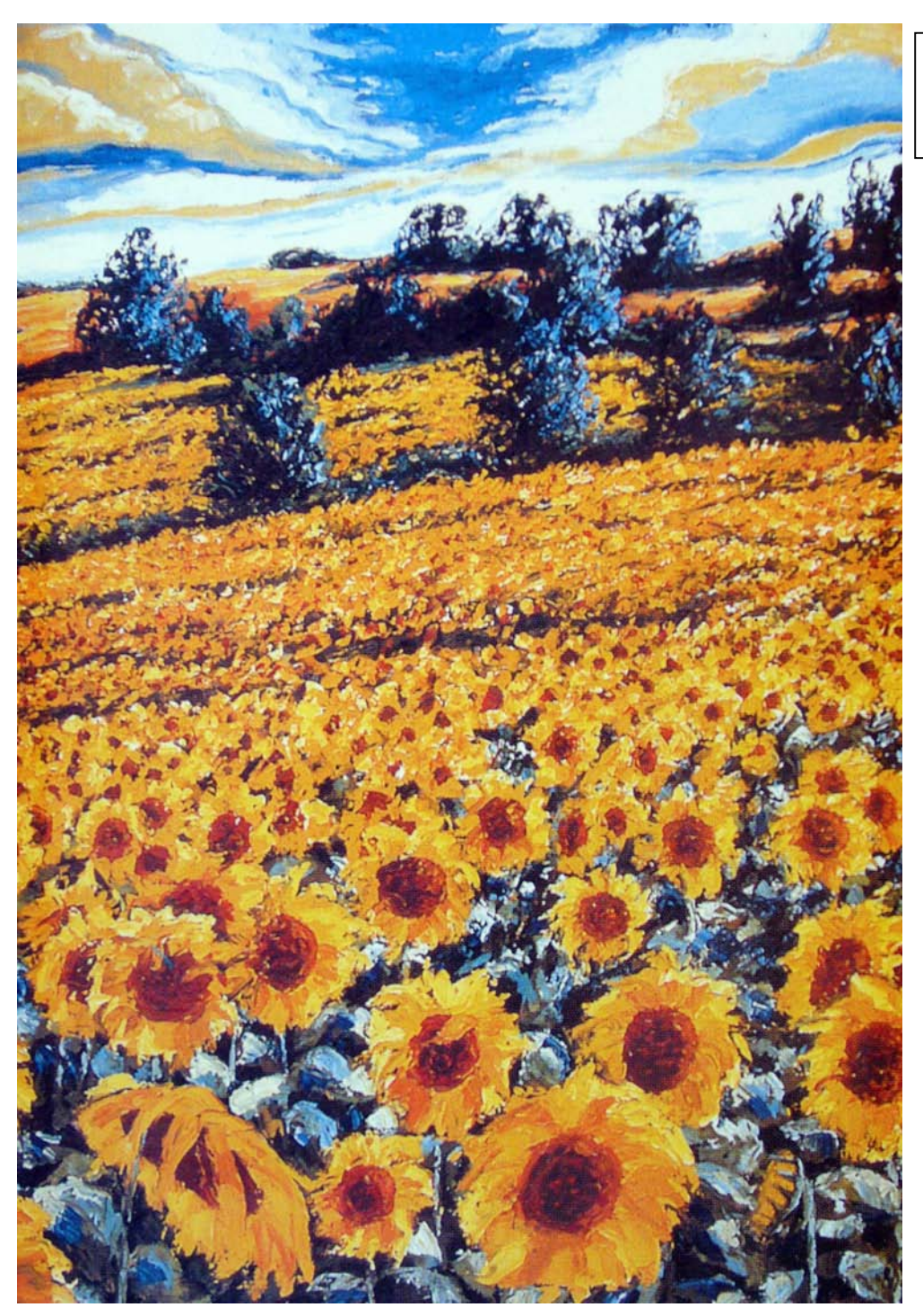
Figure 3 Sunflowers by Catherine Cavallo