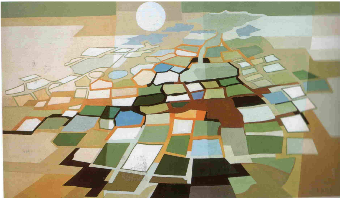
Pic. No. 2: Salt-pans