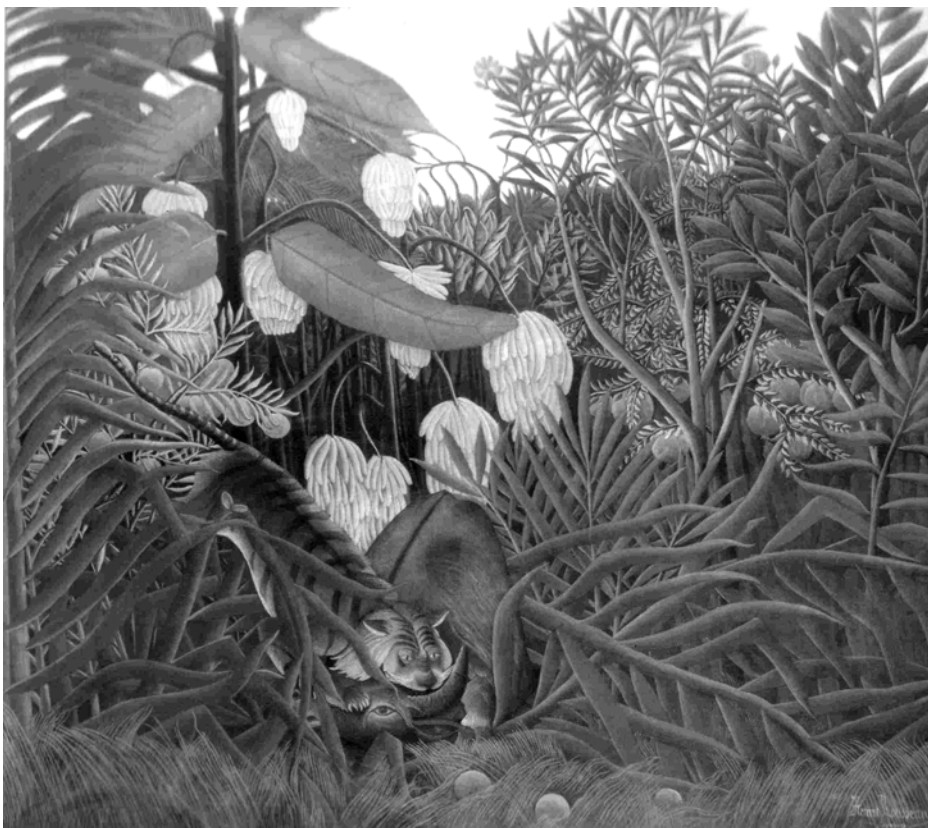
Henri Rousseau - Fight between a Tiger and a Buffalo